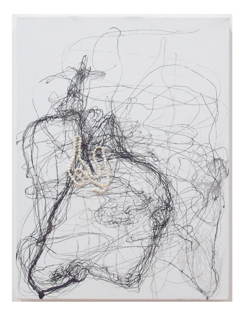
Untitled, 2008 Ink, pencil, acrylic, pearls, beads and adhesive on canvas 15 3/4 x 11 3/4 inches 40 x 30 cm