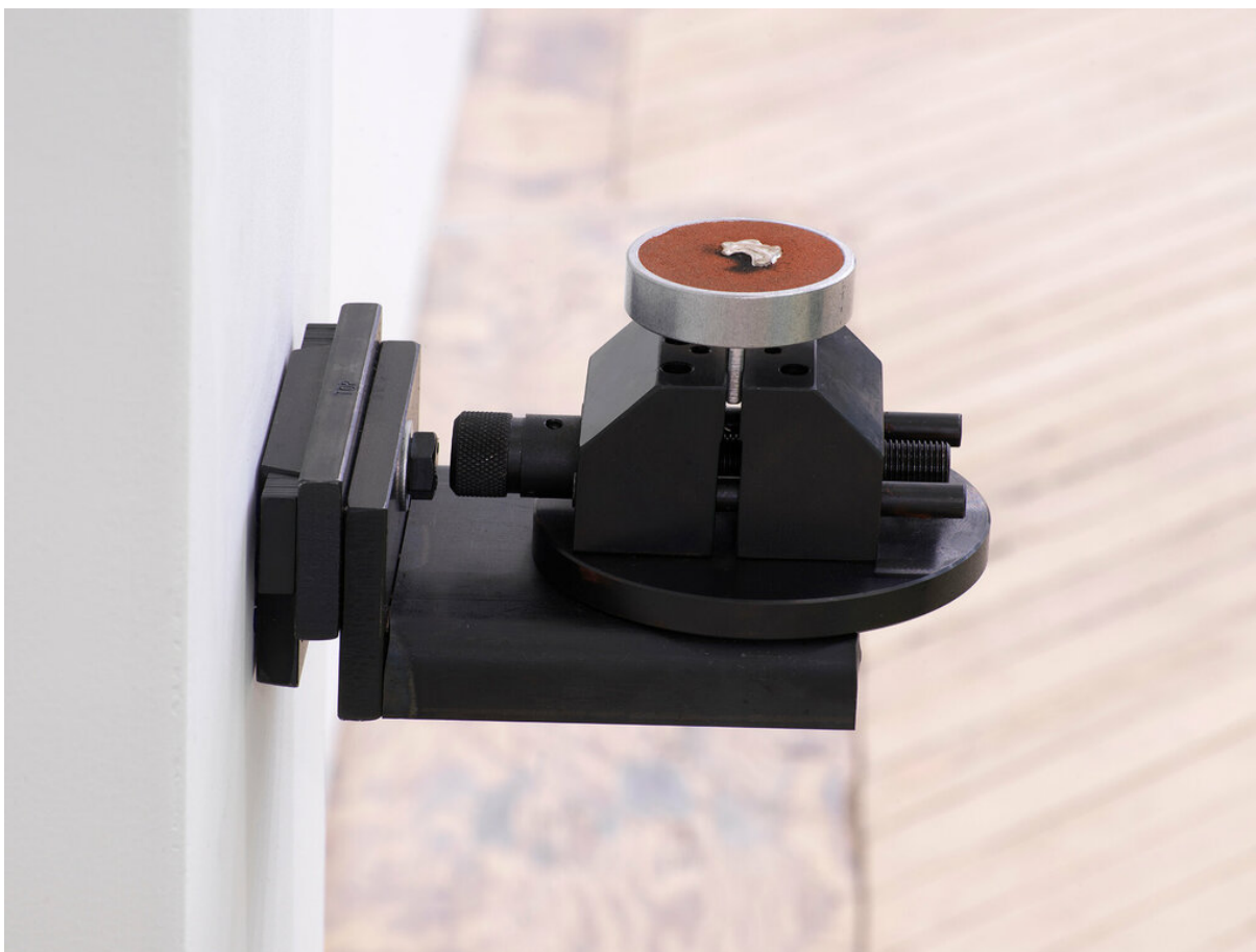
"Soft As Velvet Eyes Can See," 2021, Installation view, Bureau, New York

BUREAU 178 NORFOLK STREET NEW YORK NY 10002 bureau-inc.com