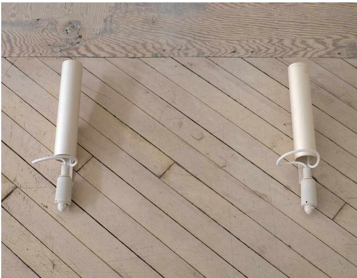
"Soft As Velvet Eyes Can See," 2021, Installation view, Bureau, New York

BUREAU 178 NORFOLK STREET NEW YORK NY 10002 bureau-inc.com