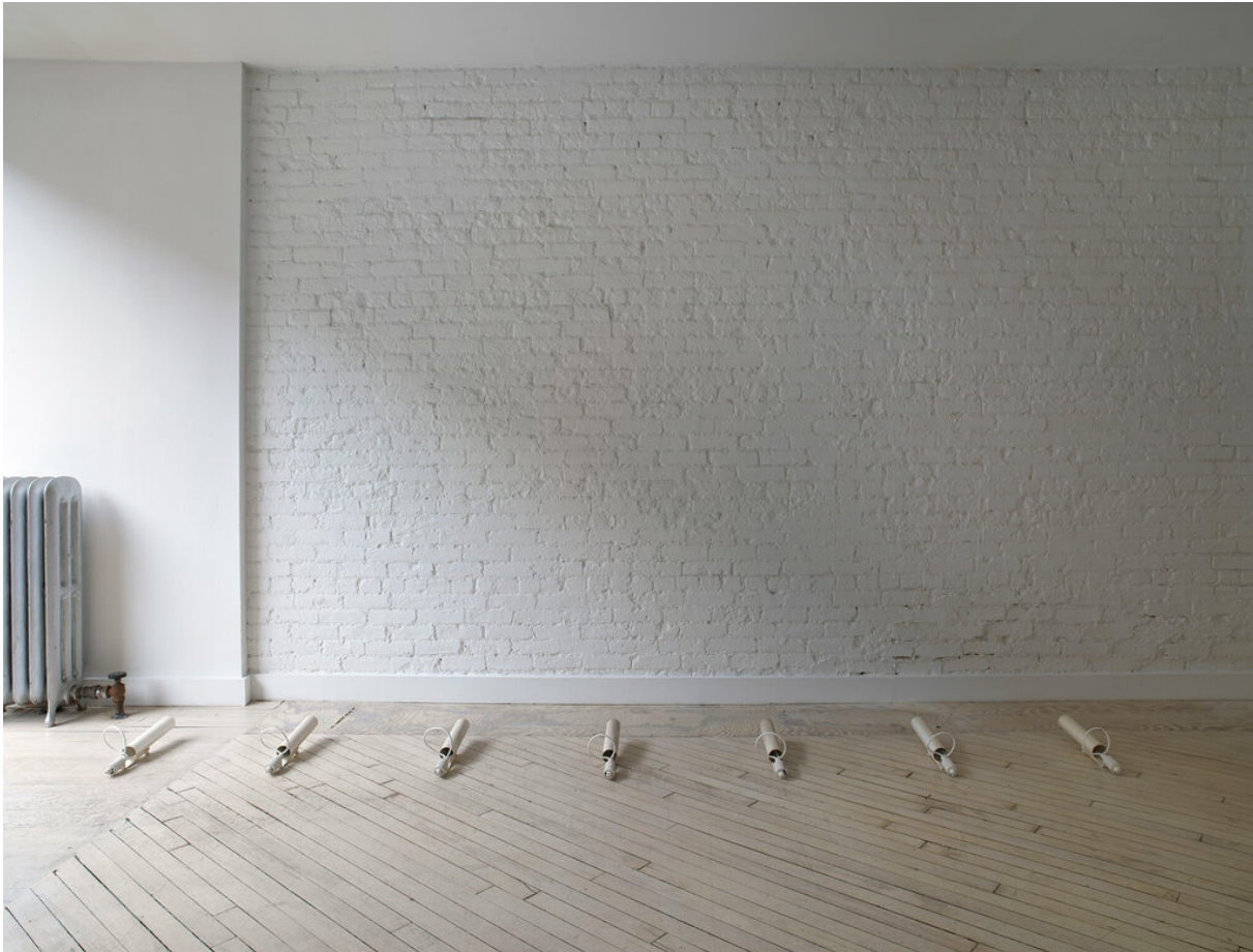
"Soft As Velvet Eyes Can See," 2021, Installation view, Bureau, New York

BUREAU 178 NORFOLK STREET NEW YORK NY 10002 bureau-inc.com