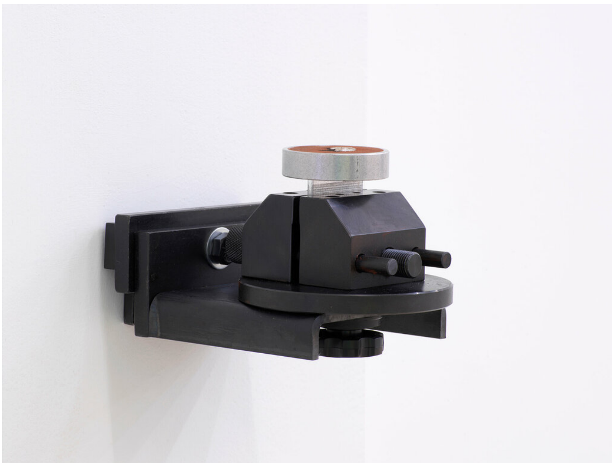
"Soft As Velvet Eyes Can See," 2021, Installation view, Bureau, New York

BUREAU 178 NORFOLK STREET NEW YORK NY 10002 bureau-inc.com