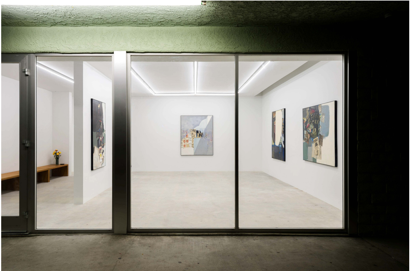
Kimiyo Mishima: Paintings-Exterior view