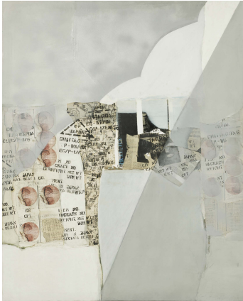
"Work 66-7A", 1966 Magazine, oil on canvas 162 x 131 cm 63-3/4 x 51-9/16 inches

"Work 66-7A", also from 1966, contains multiple images of human throat palate, gateway of consumption and communication. The painting's pastel colored, spray-painted cloud-like shapes and geometric forms are peppered with stenciled shipping crate markings indicating export of "Made in Japan" products.