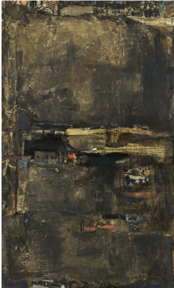
"Recollection II", 1962 Magazine, oil on canvas 153 x 91.5 cm 60-1/4 x 36 inches