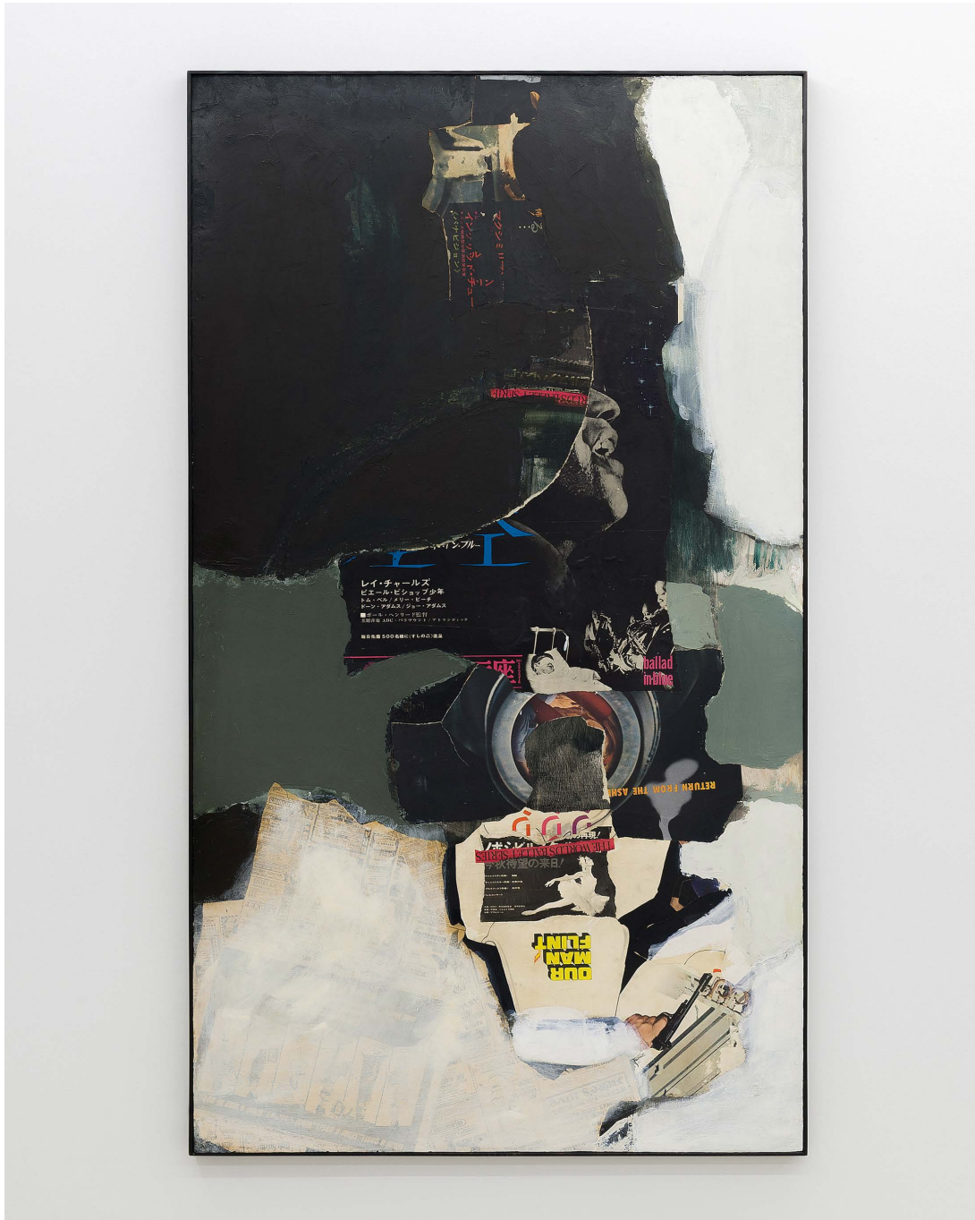
Kimiyo Mishima "Work 65-O", 1965