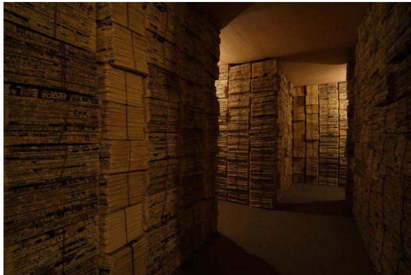
"Newspaper 08", 1997-2008 Polyester, silkscreen print. installation detail view at Art Factory Jonanjima, Tokyo 3 x 10 x 15 m 118 x 393 x 590 inches