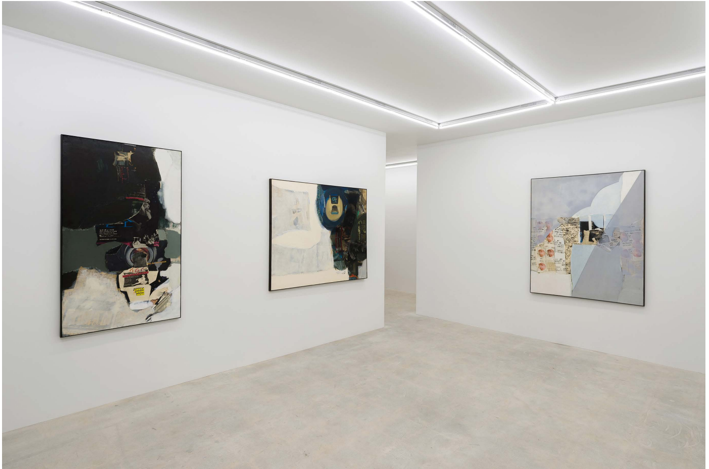
Kimiyo Mishima: Paintings-Installation view