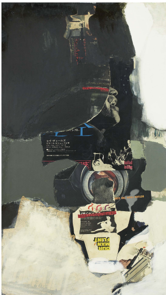
"Work 65-O", 1965 Magazine, oil on canvas 162 x 92 cm 63-3/4 x 36-1/4 inches