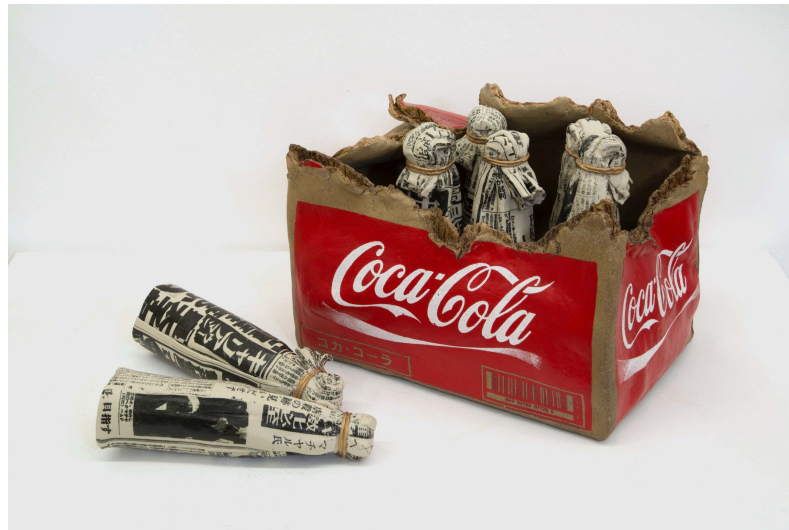
"Box Coca Cola 15", 2015 Silk screen, hand painted on Ceramic 24 x 31 x 23 cm 9-3/8 x 12-1/4 x 9-1/8 inches ©Kimiyo Mishima