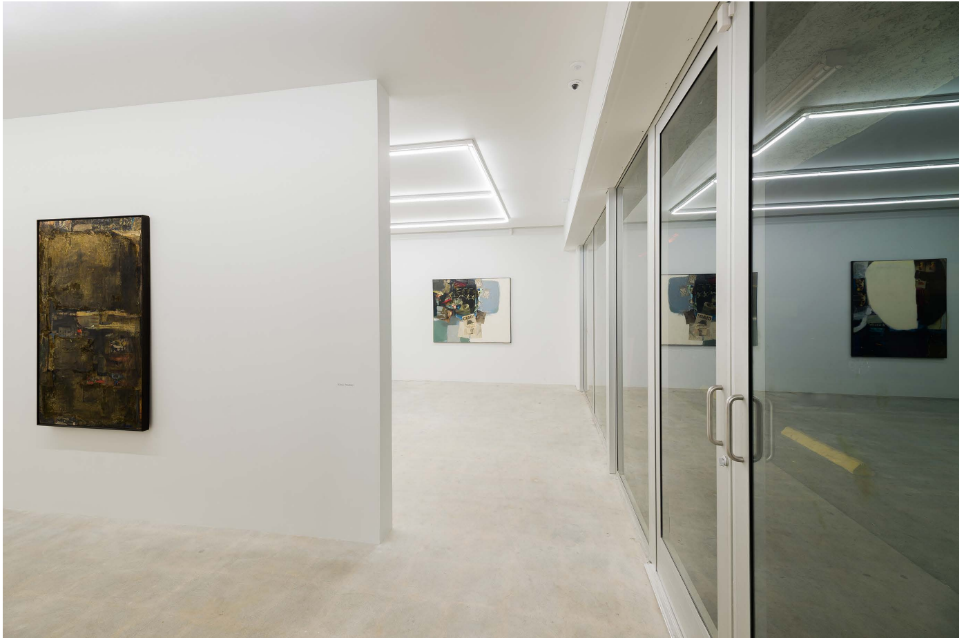
Kimiyo Mishima: Paintings-Installation view