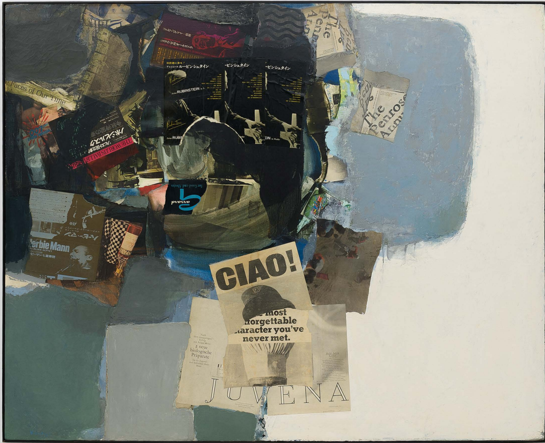
Kimiyo Mishima "Transfiguration II", 1966 Magazine, oil on canvas