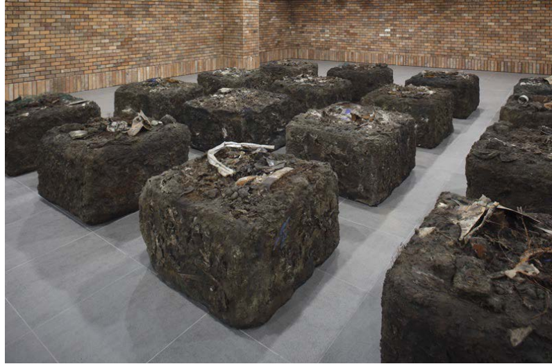
"Wreck of Time 90", 1990 Volcanic ash, FRP, ceramic, iron, wood, paint 53 x 110 x 110 cm 20-7/8 x 43-1/4 x 43-1/4 inches ©Kimiyo Mishima