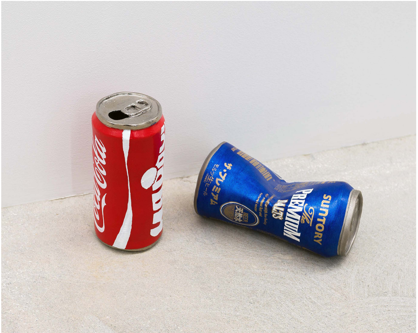
Left: Kimiyo Mishima "Work 17-CC2", 2017 Printed and painted ceramic 14.5 x 7 x 7.5 cm