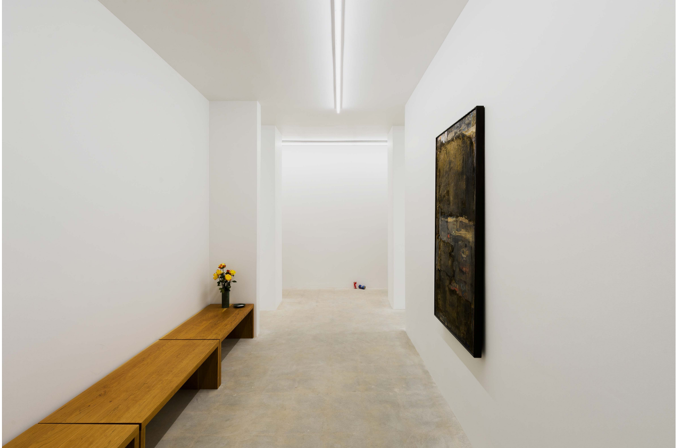
Kimiyo Mishima: Paintings-Installation view