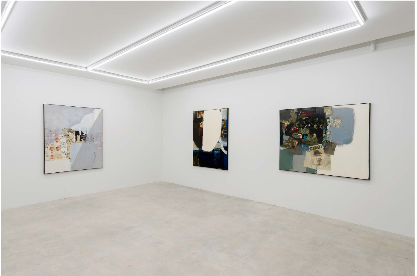
Kimiyo Mishima: Paintings-Installation view