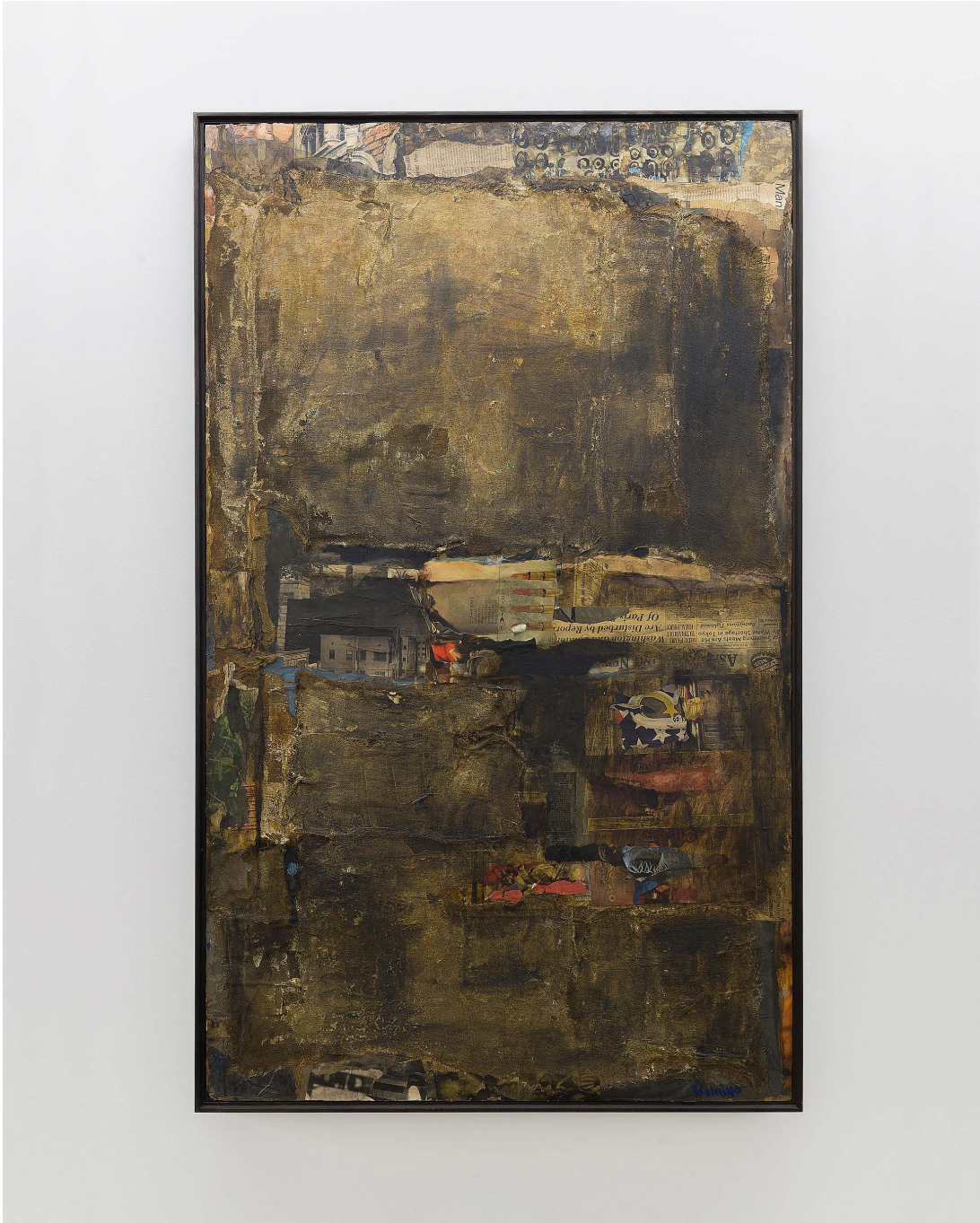
Kimiyo Mishima "Recollection II", 1962 Magazine, oil on canvas 153 x 91.5 cm 60-1/4 x 36 inches