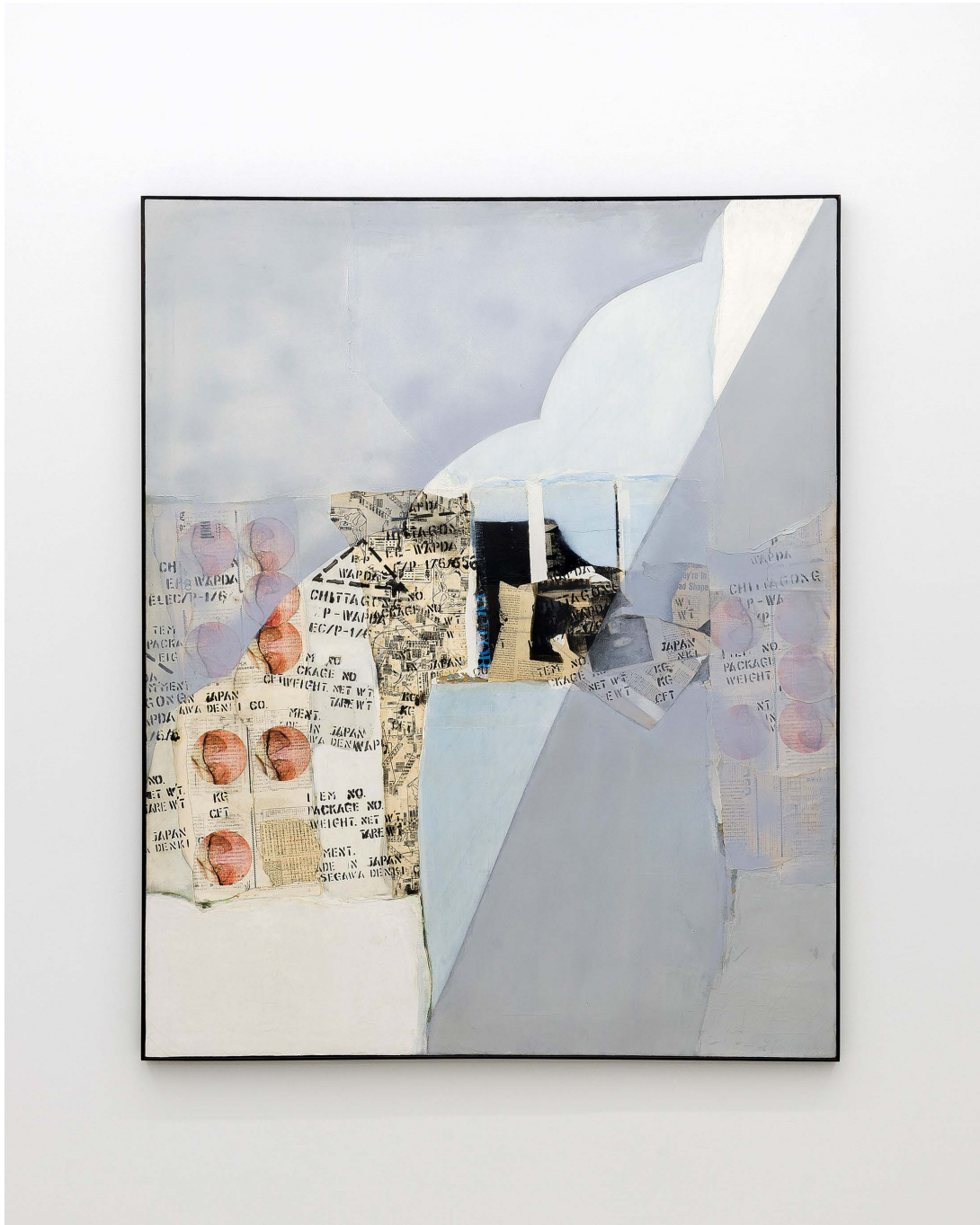
Kimiyo Mishima "Work 66-7A", 1966 Magazine, oil on canvas 162 x 131 cm 63-3/4 x 51-9/16 inches