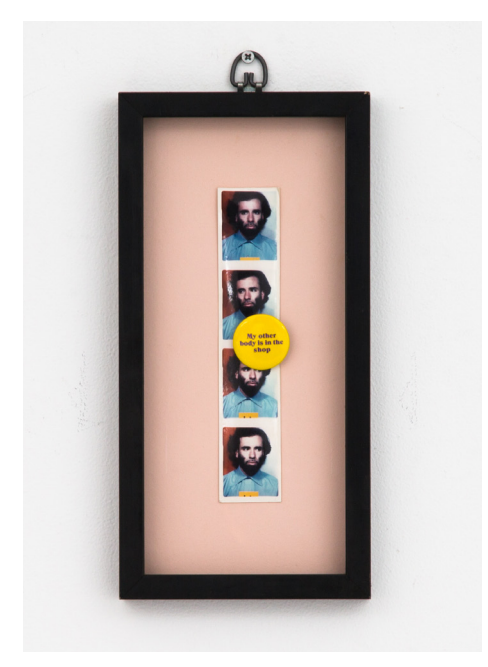
Cary Leibowitz Untitled [My Other Body is in the Shop], n.d. Photograph with pin, framed 12 3/4 x 61/2 inches Image and work courtesy the artist and INVISIBLEEXPORTS, New York, New York

Cary Leibowitz Do These Pants Make Me Look Jewish, 2001 Latex on wood panel 16 x 16 inches Image and work courtesy the artist and INVISIBLE EXPORTS, New York, New York