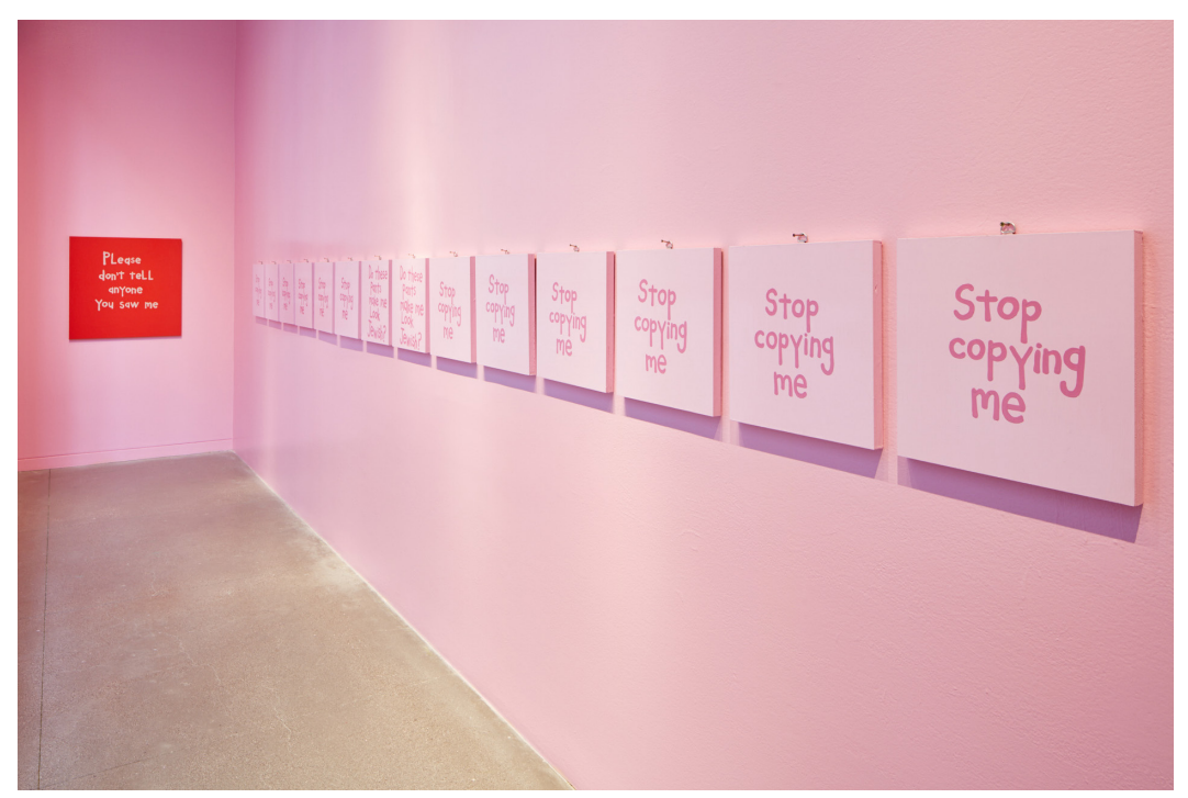
Installation view of Cary Leibowitz: Museum Show (January 26–June 25, 2017) at The Contemporary Jewish Museum, San Francisco, California.