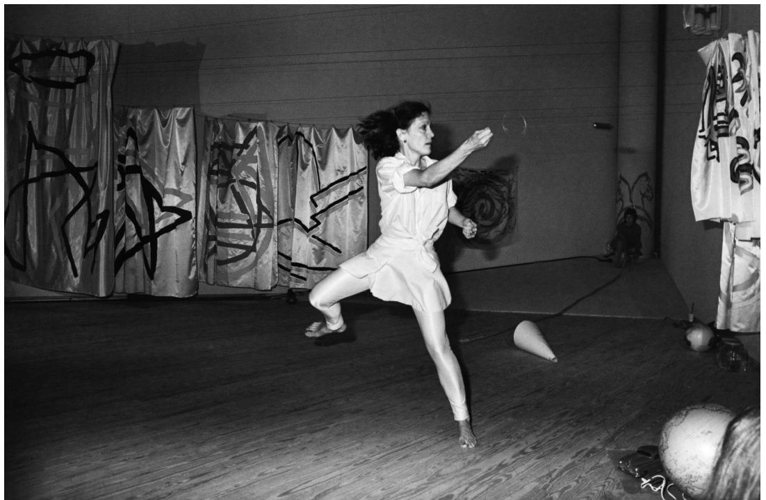
Joan Jonas, Double Lunar Dogs , 1980/1981. Performance documentation from Other Realities—Installations for Performance Contemporary Arts Museum Houston, 1981.