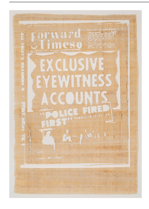
Jamal Cyrus Eroding Witness, 2014 Laser-cut papyrus 27 x 16 % inches Image and work courtesy the artist and Inman Gallery, Houston, Texas