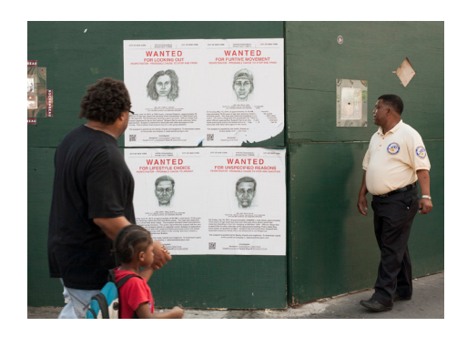
Dread Scott Wanted, 2017 Wanted posters Pigment prints Image and work courtesy the artist

made both in the studio and the social realm, the exhibition includes artworks that take social justice issues as a subject matter; and position the prison and court systems as structures for dismantling through institutional critique. The artworks in the exhibition are extraordinary for the scale and ambition by which they mobilize in order to bring visibility to offenses within the justice system.