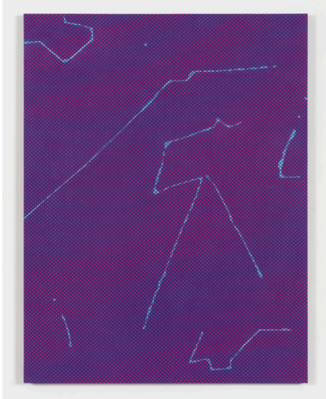
Cheryl Donegan Untitled (dots_purple_blue) , 2015 Hand-dyed cotton fabric 50 x 36 inches Image and work courtesy the artist