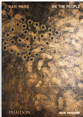
Exhibition catalogue available for purchase in the CAMH Museum Shop.

answers emerge: “we” may be people fractured by divisive partisan politics, but “we” are also resilient, creative, and democratically engaged. Ward’s work demonstrates how a gathering—whether of people or objects—can be a catalyst for transformation.