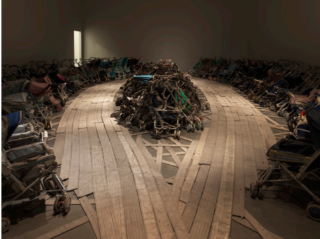
Nari Ward Amazing Grace , 1993 Baby strollers, fire hose, and audio component Dimensions variable Private collection Installation view at New Museum of Contemporary Art, New York, New York, 2019