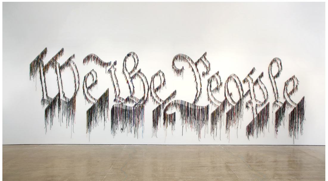
Nari Ward, We the People , 2011. Shoelaces, 96 × 324 inches. In collaboration with the Fabric Workshop and Museum, Philadelphia, Pennsylvania. Collection Speed Art Museum, Louisville, Kentucky; Gift of the Speed Contemporary, 2016.1.