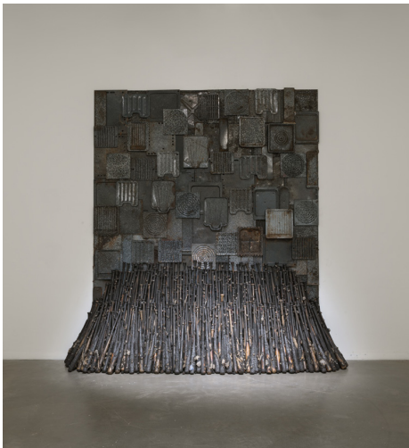
Nari Ward Iron Heavens , 1995 Oven pans, ironed sterilized cotton, and burned wooden bats 140 x 148 x 48 in Collection Jeffrey Deitch

past 25 years. Seeking out the personal and social narratives embedded in materials, he conceives of his sculptures as tools for articulating relationships between people. Over the past three decades, he has addressed topics such as historical memory, political and economic disenfranchisement, racism, and democracy in an effort to express both the tenuousness and the resilience of the artist's Harlem community—a struggle that remains relatable in communities across the United States.