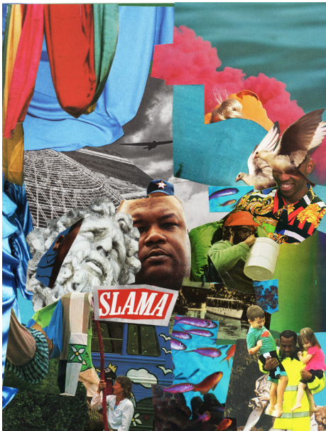
Tay Butler SLAMA , 2020 Digital collage Dimensions variable Courtesy the artist

In their photo-adjacent practices, the participating visual artists appropriate, mash-up, collage, and mutate photographic inputs, in addition to slowing time. Slowed and Thrown contends that remixing “sampled” materials is a radical aesthetic act utilized by both artists and musicians. Through reconfigurations of sourced and original materials, the featured artists draw attention to inequities stemming from race, gender, and sexual orientation, suggesting new possibilities and alternative realities.