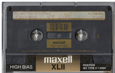
DJ Screw grey tape, courtesy the Special Collections at the University of Houston Libraries.