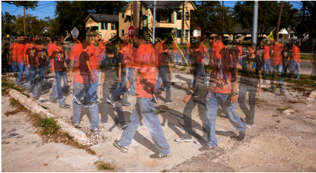
Jimmy Castillo Mendoza's Bakery , 2019 Digital inkjet print 20 x 30 inches

January 21, 2021 and public reopening on January 22. The exhibition will remain on view through Sunday, April 11, 2021. The Museum will employ comprehensive COVID-19 safeguards to ensure the health of our staff and the public.