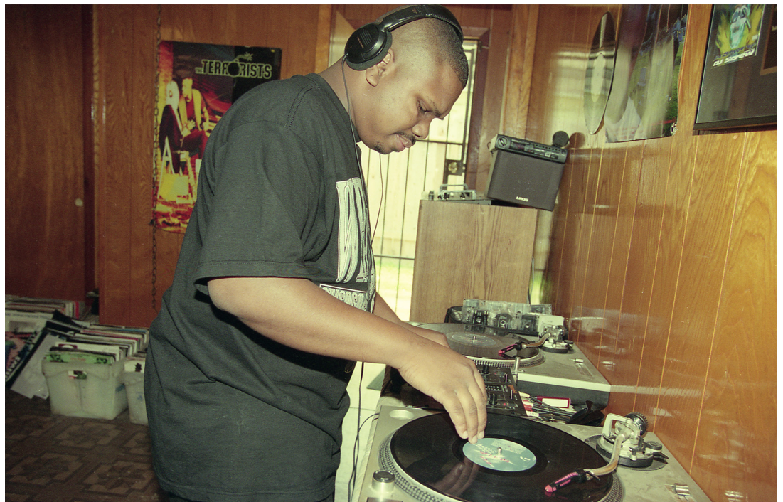
DJ Screw in his home studio.