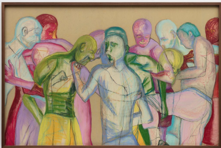
Suggested Occupation 54 (Admiral)