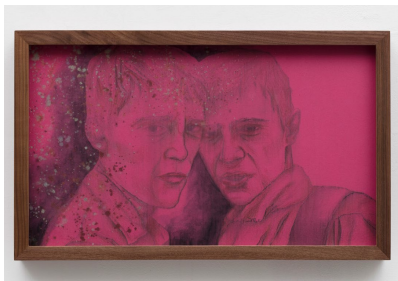
Suggested Occupation 39