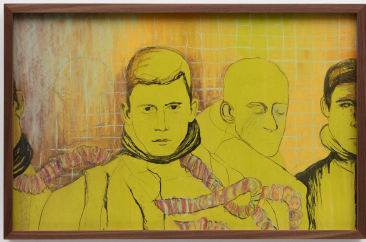
Suggested Occupation 53 (organ)