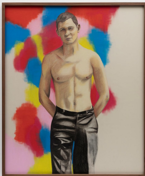
Suggested Occupation 55 (Siren Game 2)