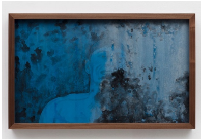
Suggested Occupation 52