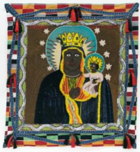
Erzulie Dantor Sequins, glass beads, silk tassels on cotton 42 x 38.5 x 2 inches 1995-2020