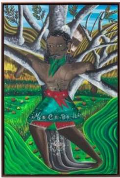
Grand Bois Oil on Masonite Board 36h x 24w in 1960