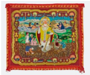
Myrlande Constant Saint Nicolas 79 x 89 inches 2020