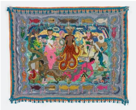
Myrlande Constant Sirenes 82 x 103 inches 2020