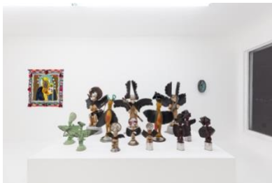
"Oiseau" Metal, wood, tire, paint Dimensions variable 2014-2020