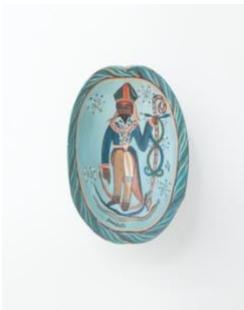
Dambala , Oil Paint on Calabash 14h x 9 1/2w x 4 1/2d in 1955-1960