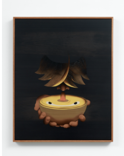
Camille Blatrix Magic Soup , 2021 marquetry 52.4 x 42 cm 20 5/8 x 16 1/2 ins (MA-BLATC-00001)