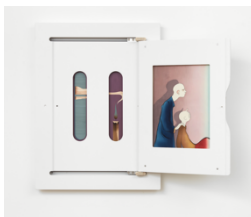
Sanya Kantarovsky & Camille Blatrix Curtain Encased , 2021 corian, marquetry, aluminium and woodblock print 83 x 63 x 7 cm 32 5/8 x 24 3/4 x 2 3/4 ins (MA-BLATC-00005)