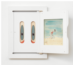
Sanya Kantarovsky & Camille Blatrix Cataracts Encased , 2021 corian, marquetry, aluminium and woodblock print 83 x 63 x 7 cm 32 5/8 x 24 3/4 x 2 3/4 ins (MA-BLATC-00008)