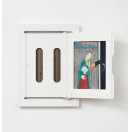
Sanya Kantarovsky & Camille Blatrix Good Host Encased , 2021 corian, marquetry, aluminium and woodblock print 83 x 63 x 7 cm 32 5/8 x 24 3/4 x 2 3/4 ins (MA-BLATC-00006)