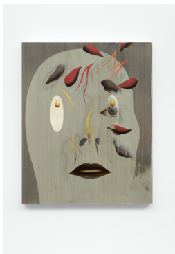
Camille Blatrix. Will , 2020 marquetry 37.6 x 30.5 cm 14 3/4 x 12 1/8 ins (MA-BLATC-00004)