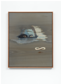
Camille Blatrix Infinite Water , 2021 marquetry 52.5 x 42.2 cm 20 5/8 x 16 5/8 ins (MA-BLATC-00002)