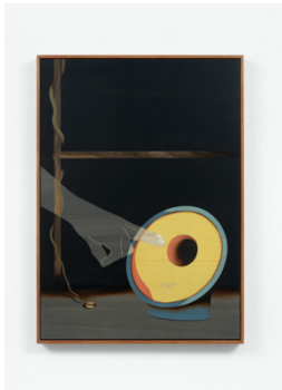
Camille Blatrix 11:11 , 2021 marquetry 52.5 x 42.2 cm 20 5/8 x 16 5/8 ins (MA-BLATC-00003)