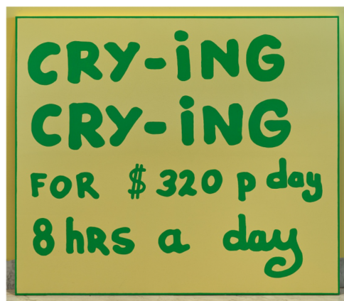
Lily van der Stokker Crying 8 hrs a day , 2015 Acrylic on wood panel 53.15 x 61.81 in. (135 x 157 cm) Courtesy the artist and Kaufmann Repetto, New York and Milan