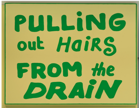
Lily van der Stokker Pulling out Hairs from the Drain , 2015 Acrylic on wood panel 42.52 x 49.61 in. (108 x 126 cm) Courtesy the artist and Kaufmann Repetto, New York and Milan

Upkeep: Everyday Strategies of Care The Arts Club of Chicago October 16, 2020–March 20, 2021 Selected Works