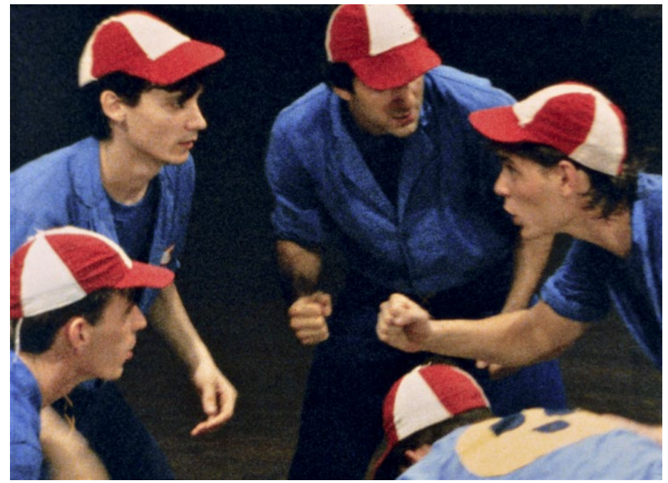
Still from You the Better