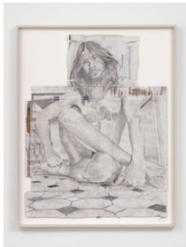
Kunle Martins Alex , 2019 Graphite on found cardboard Framed: 46 1/2 x 37 in (118.1 x 94 cm) (KNM0001)