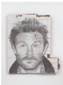
Kunle Martins Dan , 2021 Graphite and charcoal on found cardboard 65 x 55 ½ in (165.1 x 140.9cm) (KNM0005)