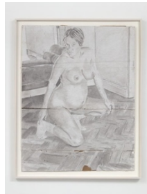
Kunle Martins Chloe , 2020 Graphite on found cardboard Framed: 46 x 36 in (116.8 x 91.4 cm) (KNM0002)