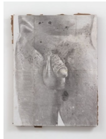
Kunle Martins Kunle , 2021 Graphite and charcoal on found cardboard 63 ¾ x 47 ½ in (160 x 119.4cm) (KNM0006)