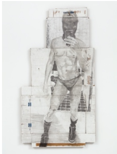
Kunle Martins Soil , 2021 Graphite and charcoal on found cardboard 45 ½ x 24 in (114.3 x 61cm) (KNM0004)