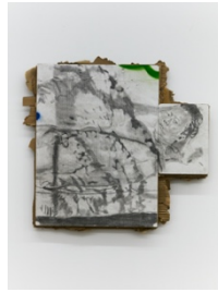
Kunle Martins Tommy , 2021 Graphite and charcoal on found cardboard 35 x 92 in (88.9 x 233.7cm) (KNM0009)