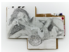
Kunle Martins Vashtie , 2021 Graphite and charcoal on found cardboard 48 ¾ x 65 in (123.8 x 165.1 cm) (KNM0007)