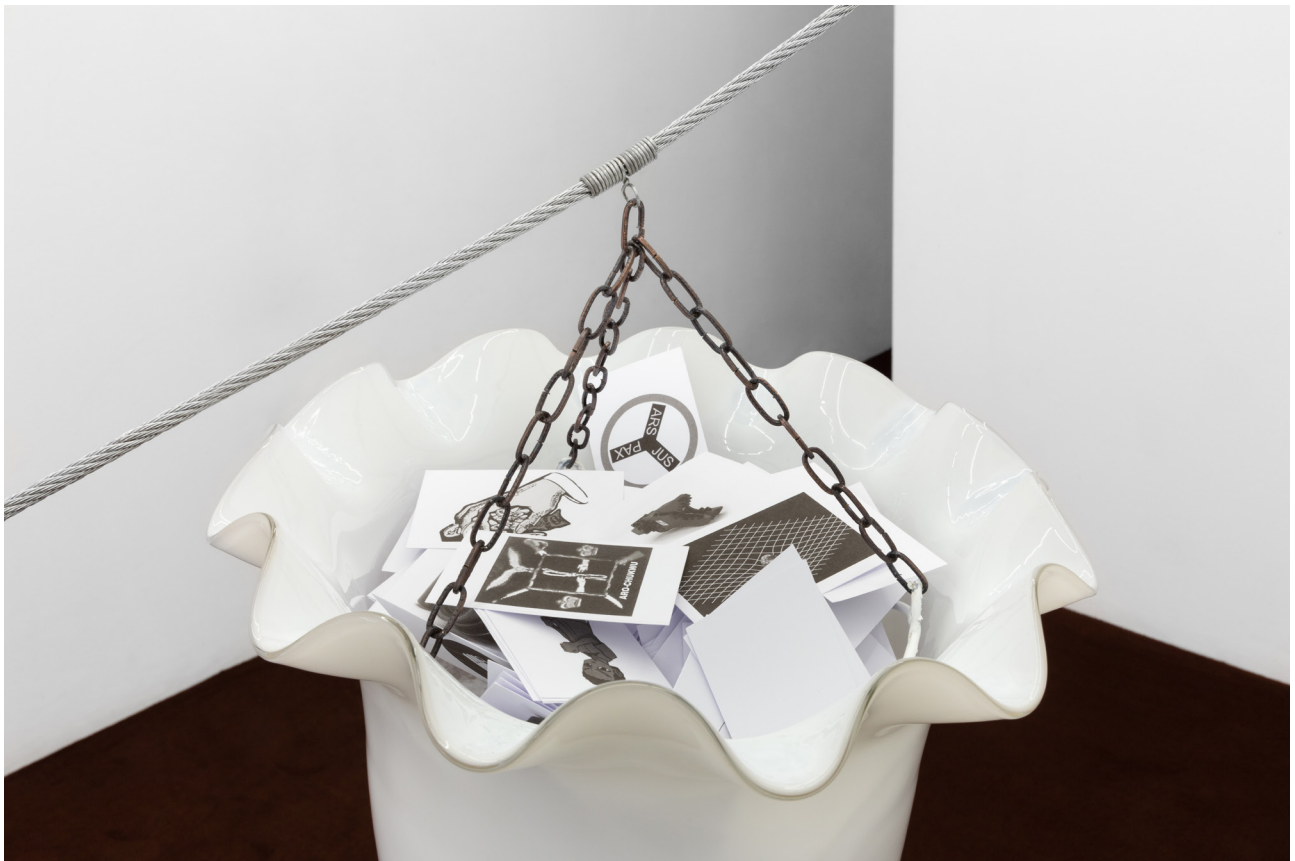
Dozie Kanu value order [gentrity.pt] 2021 Installation view at Madragoa, Lisbon, PT