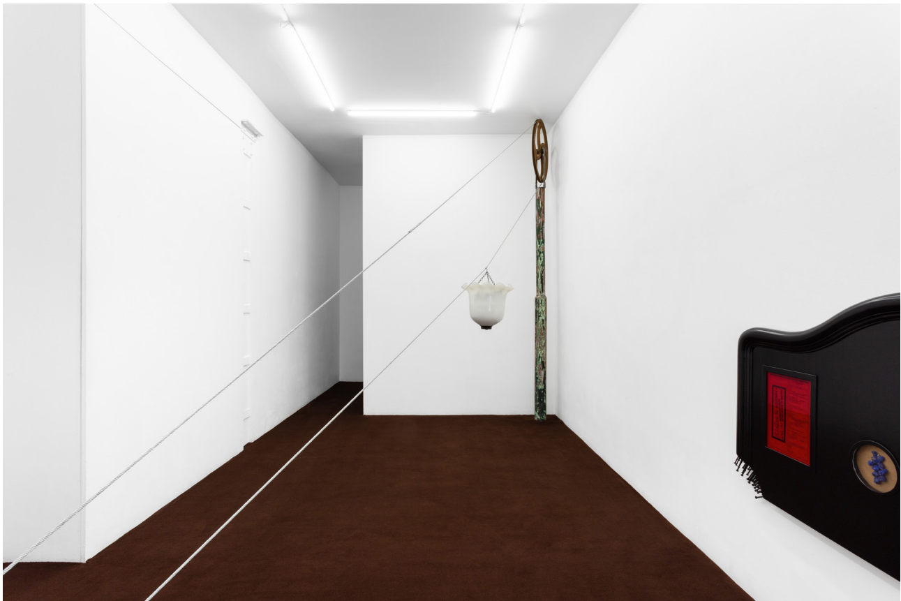
Dozie Kanu value order [gentrity.pt] 2021 Installation view at Madragoa, Lisbon, PT