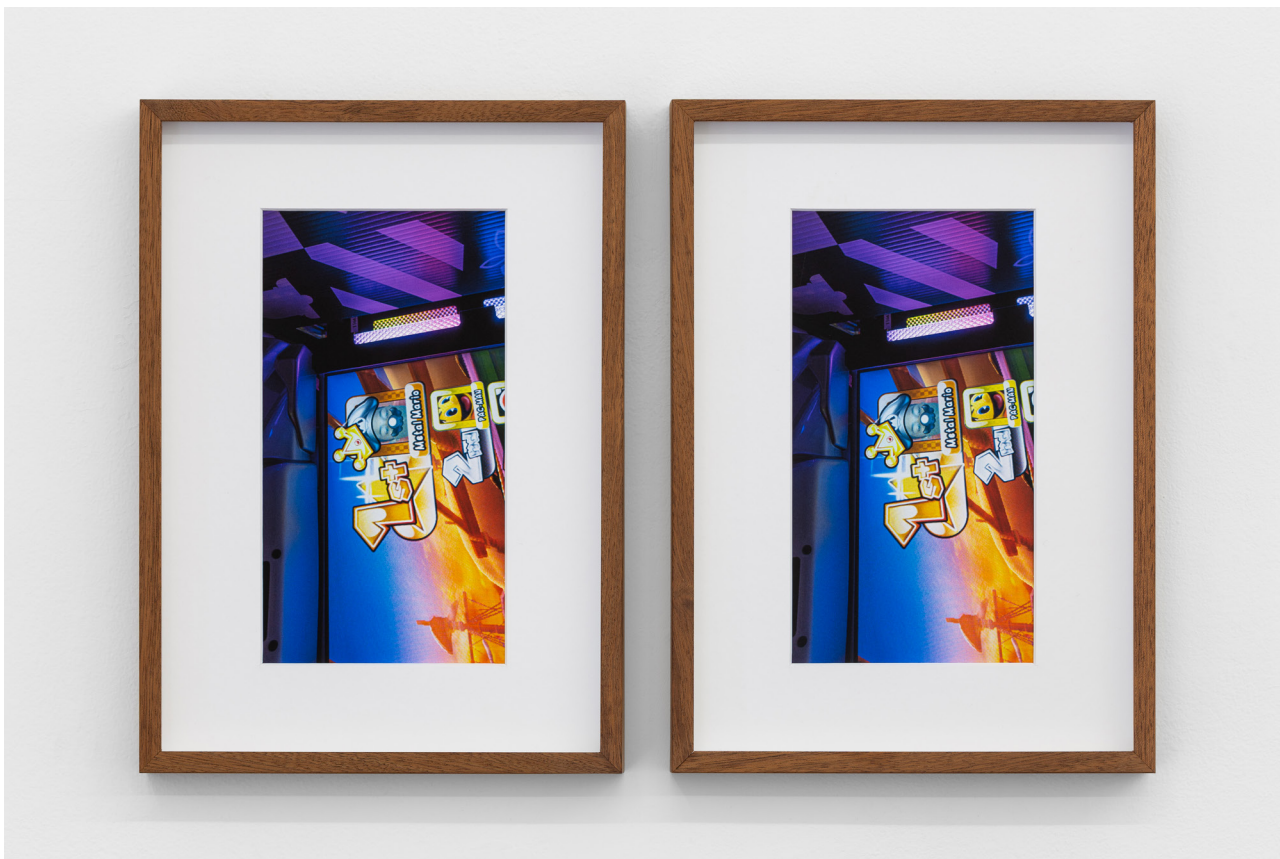
Dozie Kanu Las Vegas Arcade Soho London (Z-Ro Merits) 2021 inkjet print on paper 31 x 22 cm 2 parts (31x22 each), framed