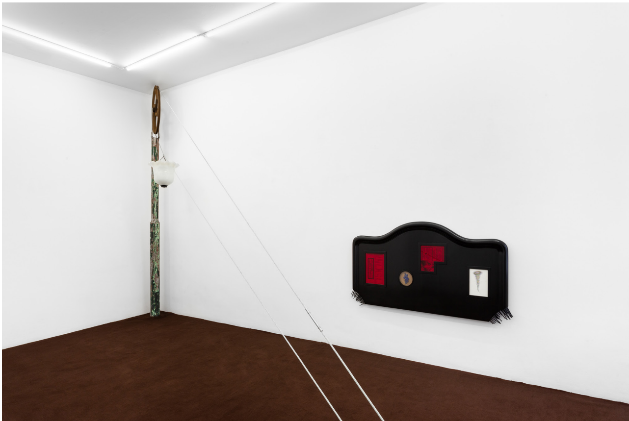
Dozie Kanu value order [gentrity.pt] 2021 Installation view at Madragoa, Lisbon, PT