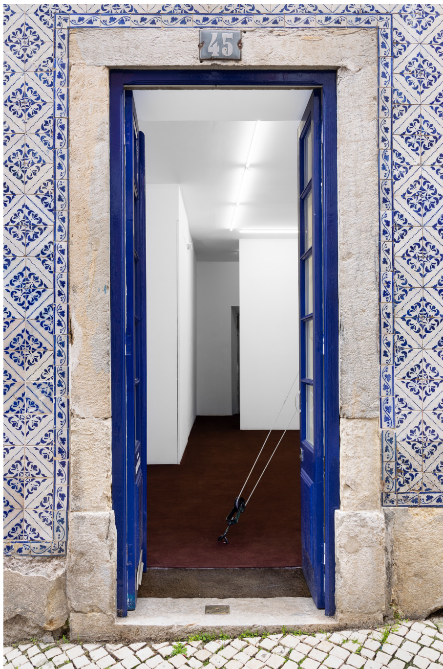
Dozie Kanu value order [gentrity.pt] 2021 Installation view at Madragoa, Lisbon, PT