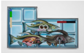
Orion Martin M.R.E. , 2021 Oil on linen, aluminum frame 27.5 x 47.5 in (69.9 x 120.7 cm) OM082