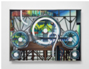
Orion Martin Traditional Grip , 2021 Oil on linen, aluminum frame 20 x 28 in (50.8 x 71.1 cm) OM085