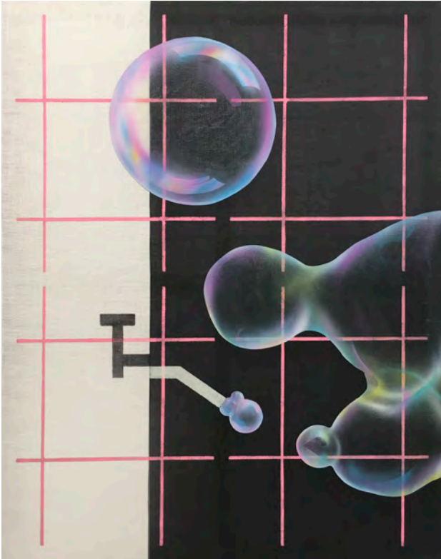
Maja Vukoje, Bubble, 2017, acrylic paint on burlap, 190 x 150 cm