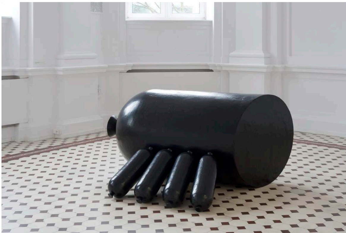
Monika Zawadzki, Nursing Mother , 2014, epoxy resin, acrylic paint, 150 x 100 x 214 cm