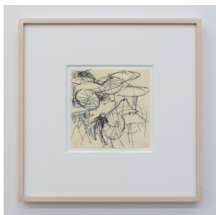
Mary Ann Aitken Untitled , c. 1989 Marker on paper 5.75 x 5.75 in. (14.6 x 14.6 cm), 13.5 x 13.5 x 1.25 in. (34.3 x 34.3 x 3.2 cm) framed