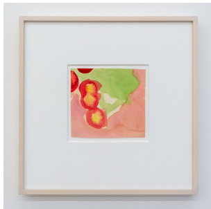
Mary Ann Aitken Untitled , c. 1989 Watercolor on paper 5.25 x 5.5 in. (13.3 x 13.9 cm), 13.5 x 13.5 x 1.25 in. (34.3 x 34.3 x 3.2 cm) framed