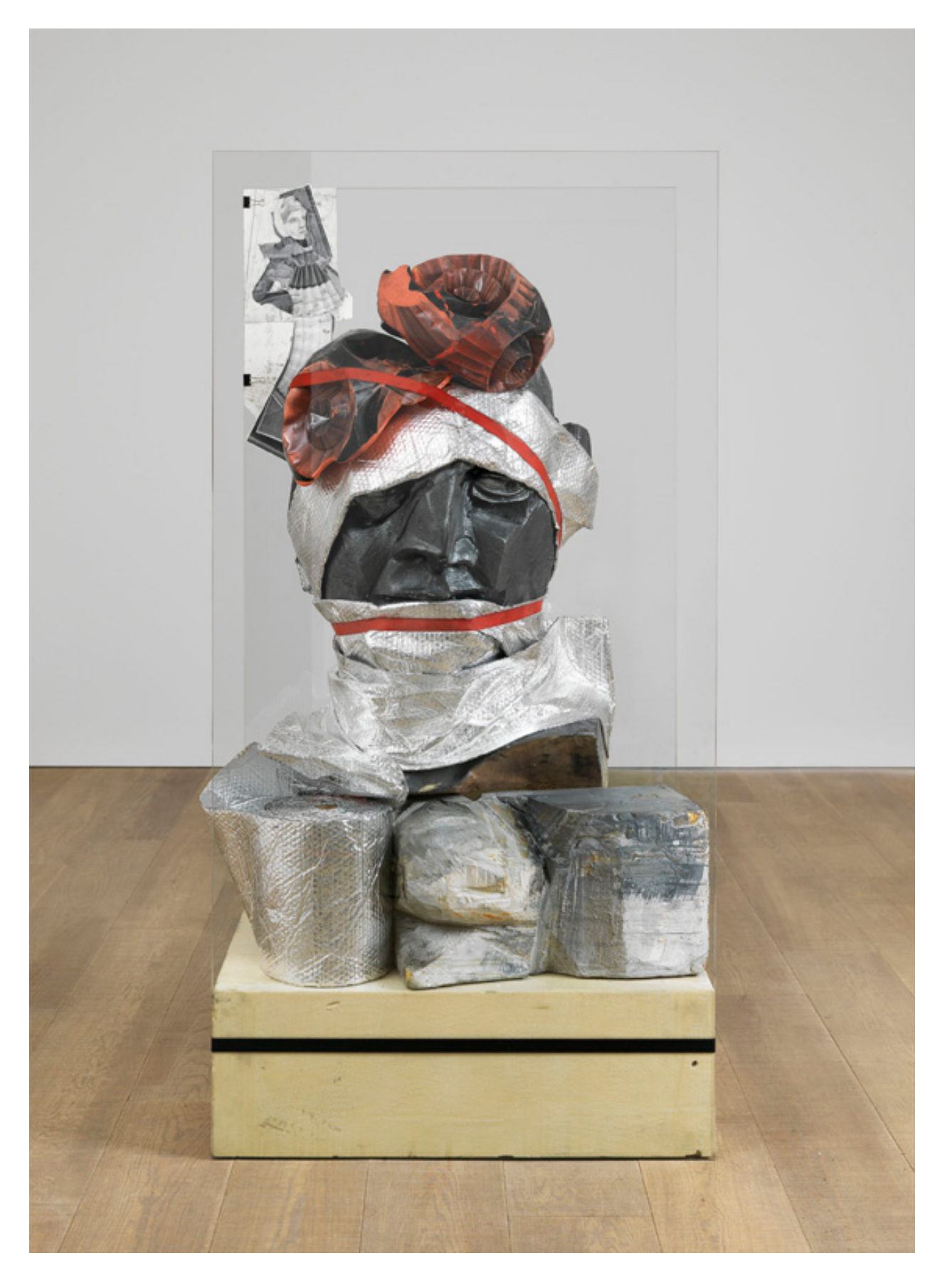
Magpie 2009 polyurethane foam, wax, epoxy resin, graphite powder, photocopy collage with graphite on paper, clips, pigment, insulating bubble wrap, glass, ratchet strap 183x91.2x64.5 cm, 72x35.9x25.4 ins MA-MONAM-00075