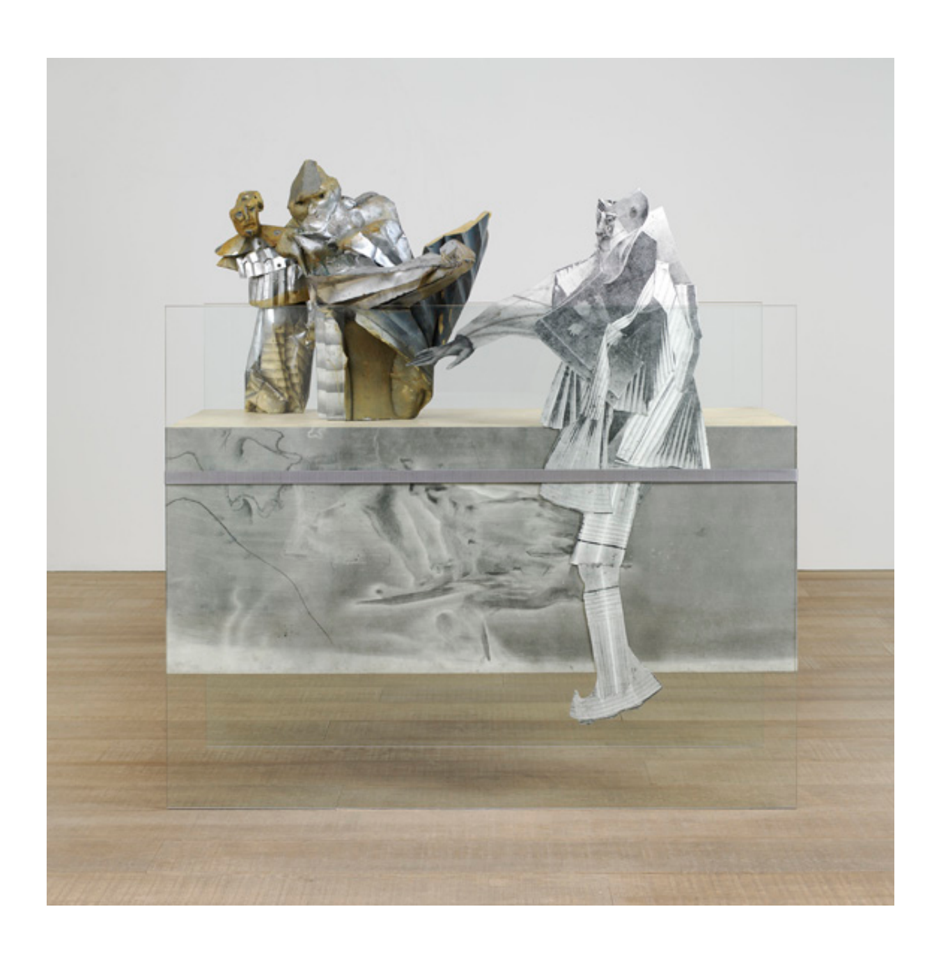
Squint Spirits 2009 polyurethane foam, wax, epoxy resin, photocopy and charcoal on paper, aluminium, paint, pigment, metal leaf, glitter, glass, ratchet strap 153.5x152.3x68 cm, 60.4x60x26.8 ins