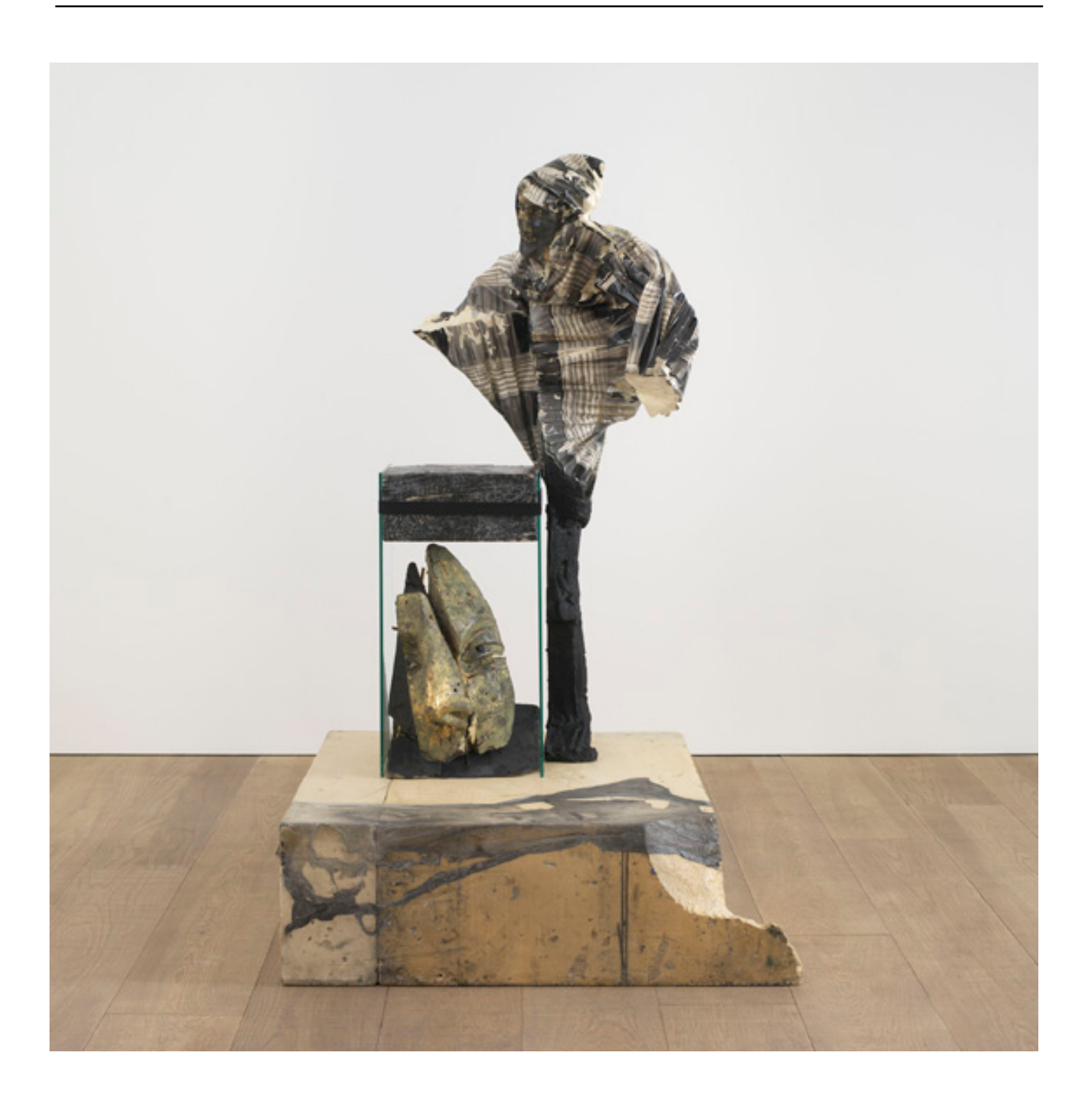
St. Julian and Wall 2009 polyurethane foam, wax, epoxy resin, metal leaf, graphite on paper, glass, photocopy on mylar, paint, aluminium, 154.7x96x92 cm, 60.9x37.8x36.2 ins