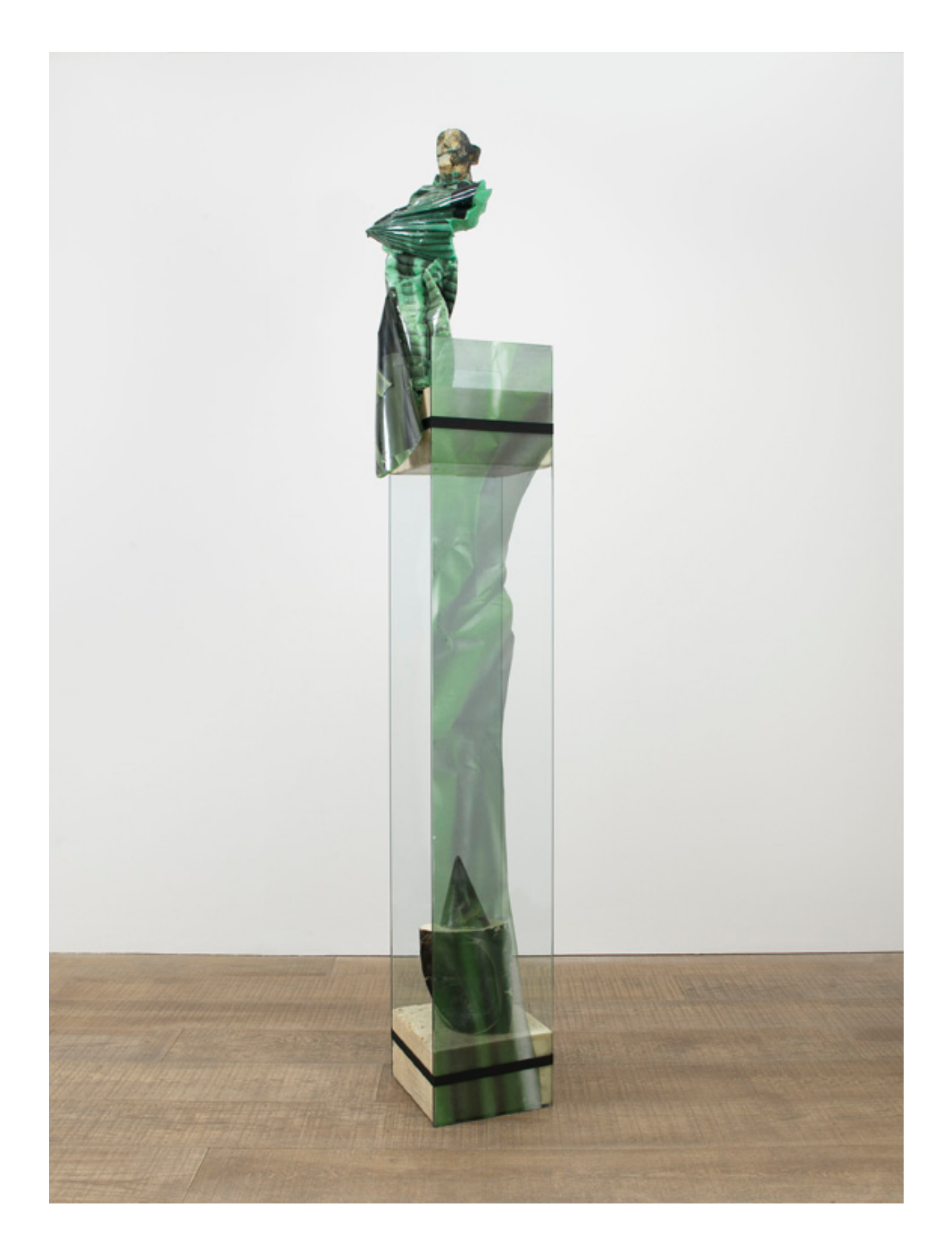
The Greens Keeper 2009 polyurethane foam, wax, epoxy resin, glitter, paint, adhesive screen, glass, ratchet straps 239.5x40x38 cm, 94.3x15.7x15 ins