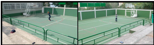
It's all Real: Omar and Younes, 2014 2 synchronized HD videos 14 min. 50 sec.