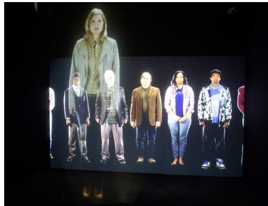
A Letter Can Always Reach its Destination, 2012 Video installation, 2 synchronized HD videos, hologram screen 122 min.