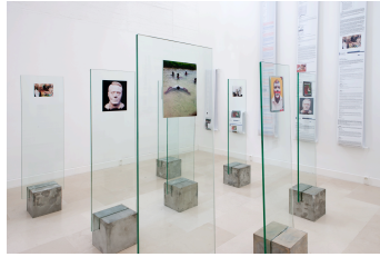
The Trophy Room, 2014 Concrete, glass, and photographs, photo prints on rolls Variable dimensions