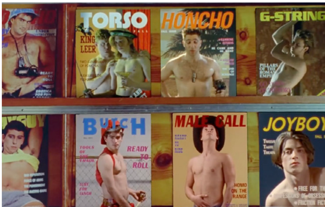
still, Gus Van Sant, My Own Private Idaho , 1991

PL: I love the magazine scene in that movie as well, where the magazines are talking to each other. It's a great scene.