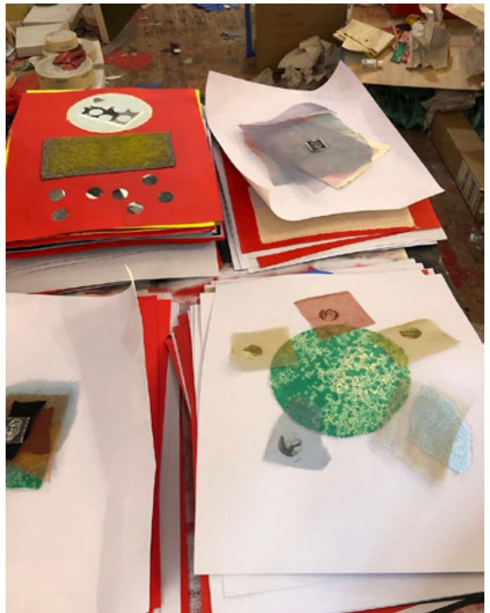
collages in Paul Lee's studio

PL: I made about 100 collages, and then we made a selection from there. I'm still working on them. It's a freeing gesture to collage—pulling things from all around the studio. There'd be a pile of materials, and it