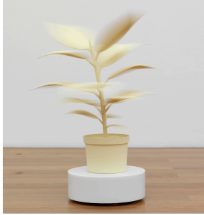
Lurking Sculpture (Rotating Rubber Plant) , 2016 3D printed PMMA, epoxy resin, paint, marble, rotating stand Diminutions variable Courtesy the artists and Marcelle Alix, Paris