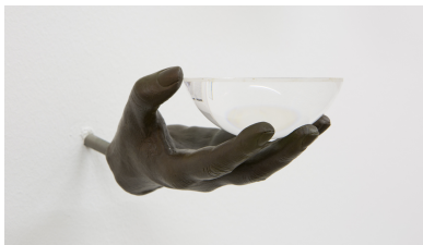
living images (1) , 2016 Bronze cast, glass lens 3 x 4 x 7 in. Private Collection