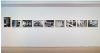
To see the Things Amongst Which We Live , 2012 9 black and white analogue photographs 16.3 x 23.6 in. each