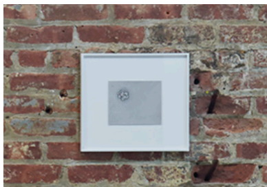
All the Best Memories are Hers, 2018 Silver gelatin print from LVT negative 11.5 x 12.5 in. (29.2 x 31.8 cm)