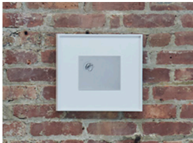
All the Best Memories are Hers, 2018 Silver gelatin print from LVT negative 11.5 x 12.5 in. (29.2 x 31.8 cm)