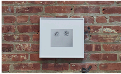
All the Best Memories are Hers, 2018 Silver gelatin print from LVT negative 11.5 x 12.5 in. (29.2 x 31.8 cm)