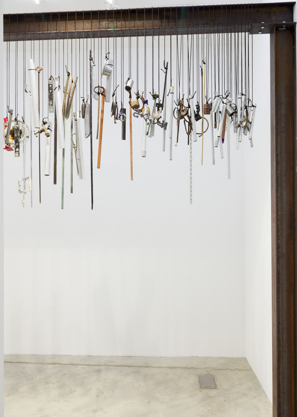
VIRGINIA OVERTON Untitled (chime) , 2020 Alternate view