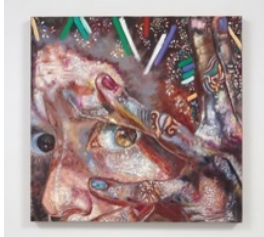
Constanza Schaffner Lois , 2021 Oil on linen 33 x 34 in (83.8 x 86.4cm) (CS1001)