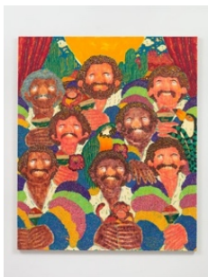
Koichi Sato Latin Beat - Sunrise , 2021 Acrylic and oil on canvas 72 x 60 in (182.9 x 152.4cm) (KS1002)