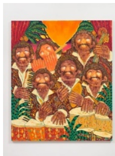
Koichi Sato Latin Beat - Sunset , 2021 Acrylic and oil on canvas 72 x 60 in (182.9 x 152.4cm) (KS1000)