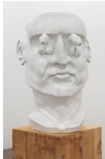
Nicolás Guagnini Ludwig , 2014 Vitrified glazed ceramic 43 x 31 x 33 in (109.2 x 78.7 x 83.8cm) (NG6630)