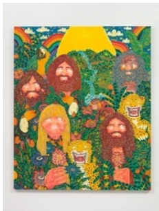
Koichi Sato Find Your Soul and Life , 2021 Acrylic and oil on canvas 72 x 60 in (182.9 x 152.4cm) (KS1003)