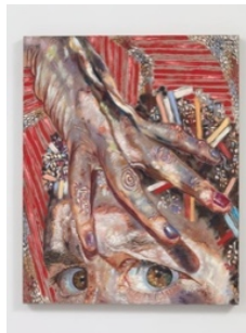
Constanza Schaffner Abrazo , 2021 Oil on linen 40 x 32 in (101.6 x 81.3cm) (CS1002)