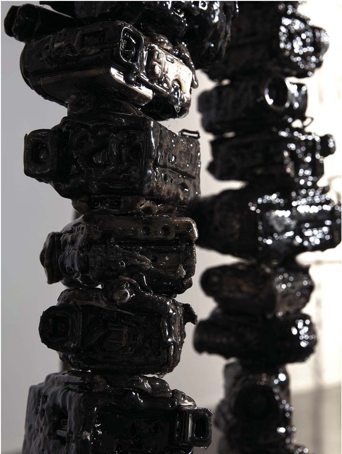
职业 Occupation , 2016