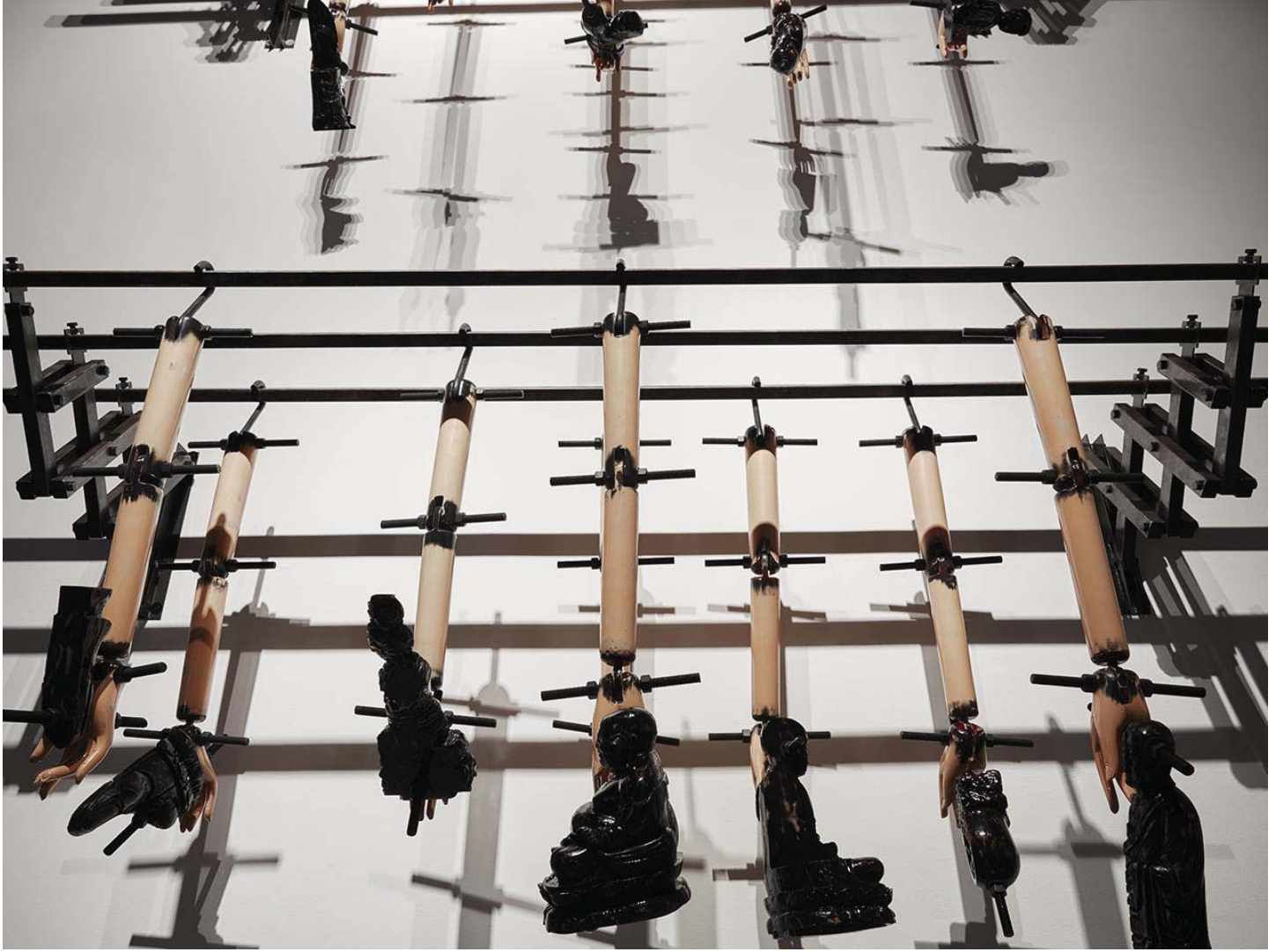
阳台 Balcony , 2016