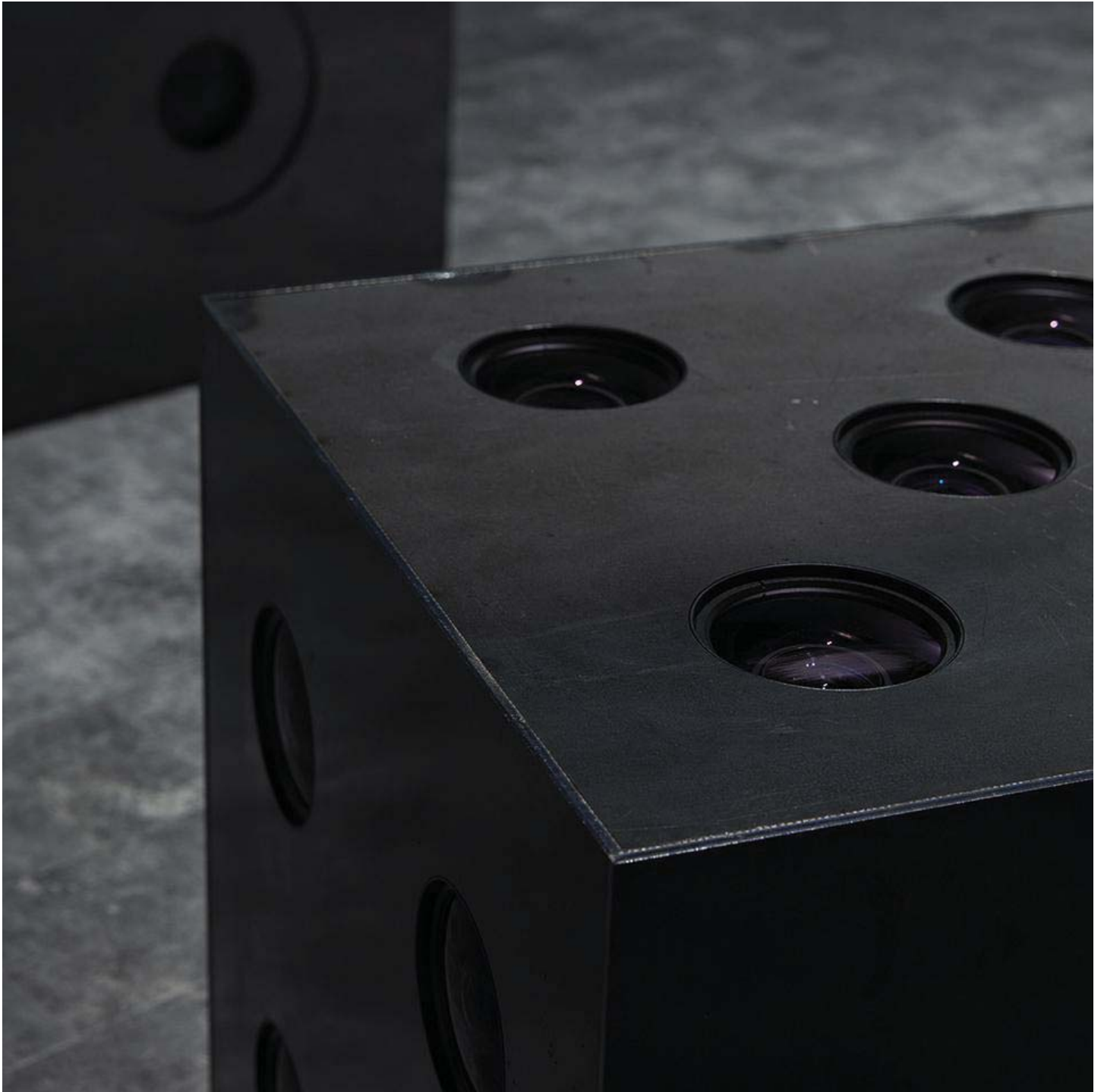
窥视 Scopophilia , 2016