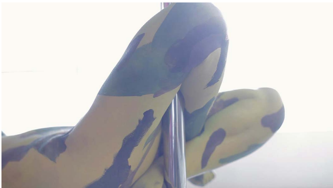
示范 Exemplar , 2016 单通道视频, 彩色有声 single channel digital video, color, sound 05' 14" 录像截帧 | video stills