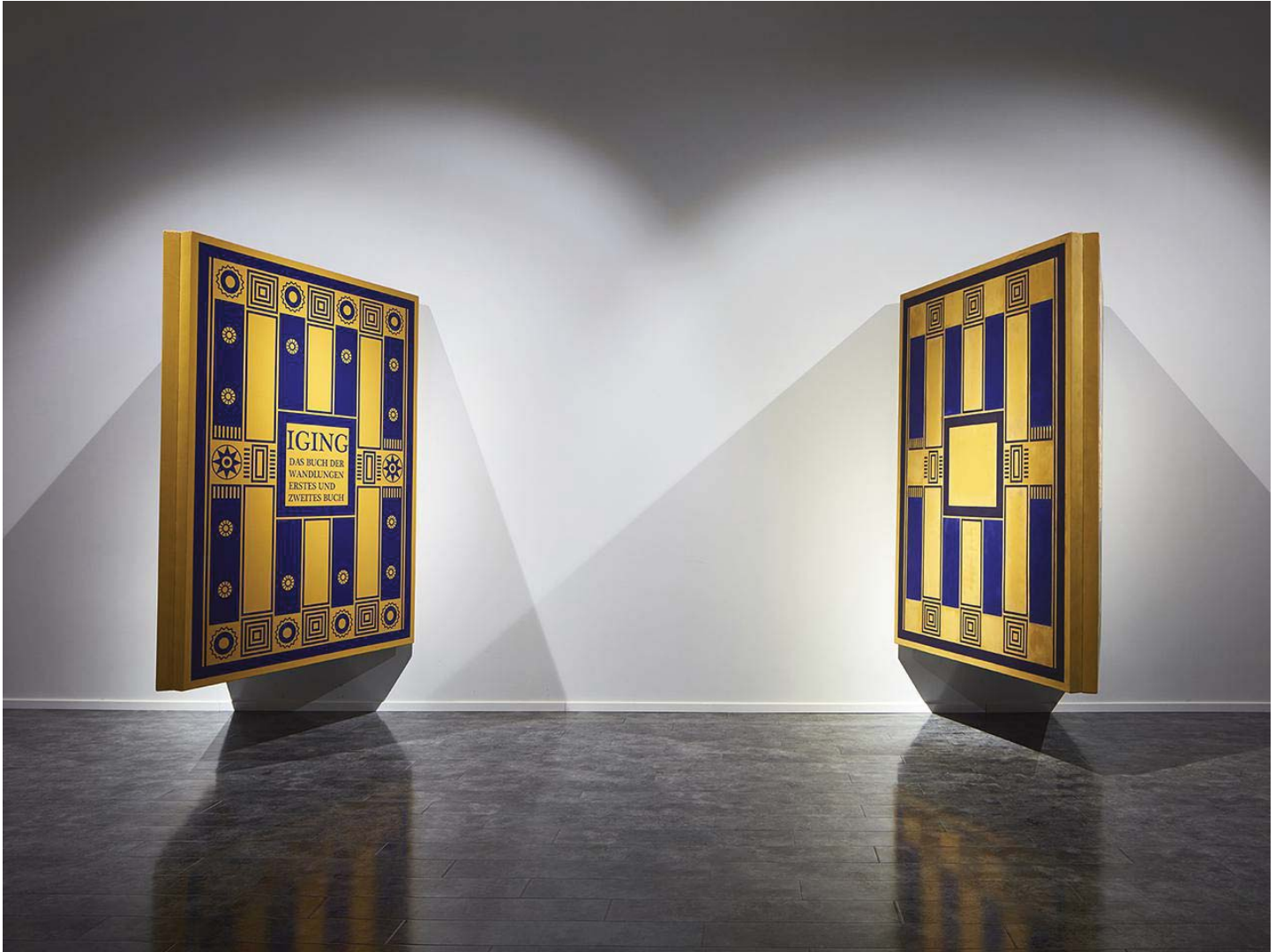
易经 I Ching , 2016 布面丙烯 | Acrylic on canvas 140 x 190 cm x 4 pieces 展示尺寸 : 115 x 135 x 190 cm