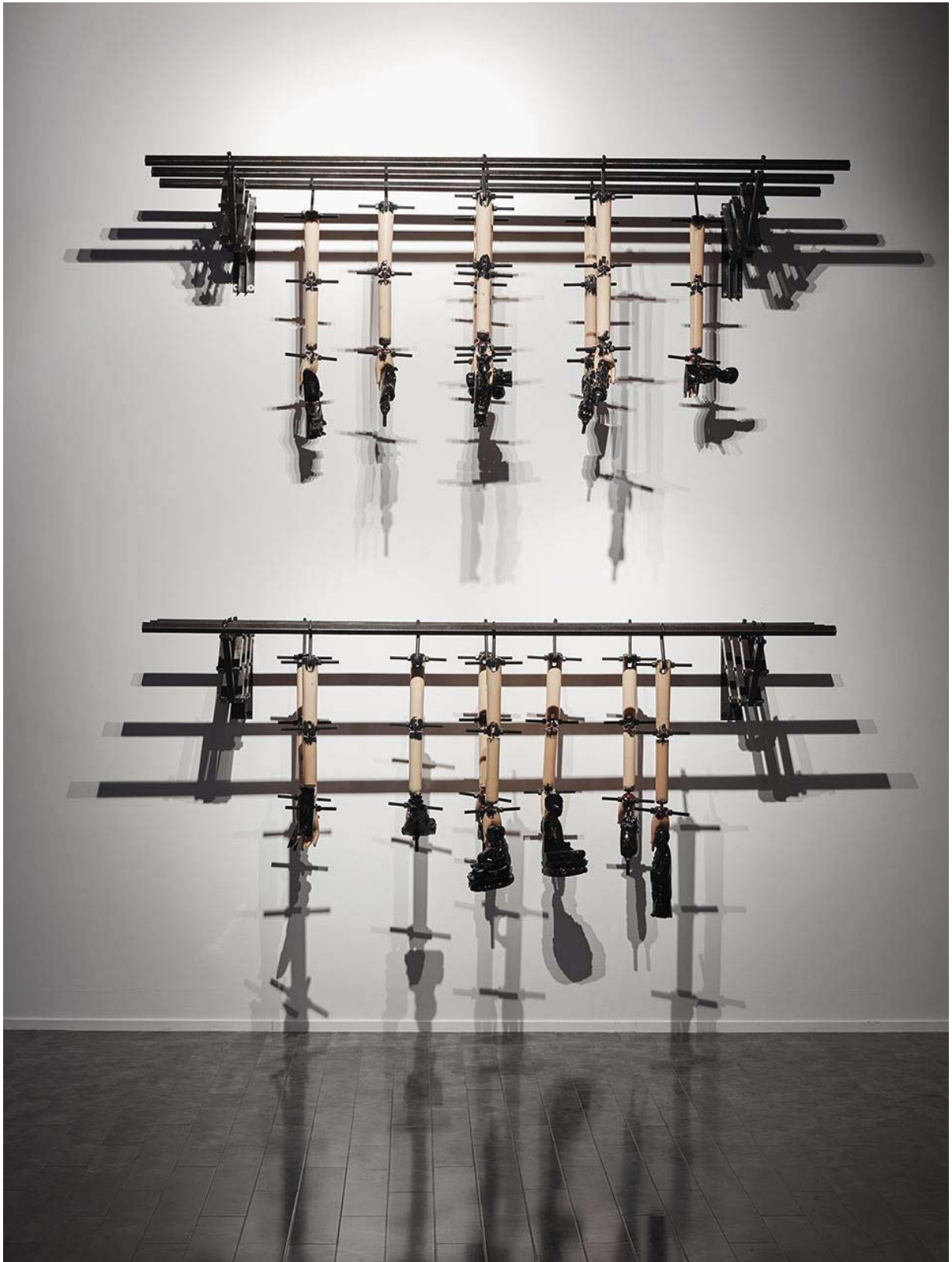
阳台 Balcony , 2016 铁、木雕、喷漆 | iron, wood carving, spray-paint 300 x 130 x 90cm x 2 pieces