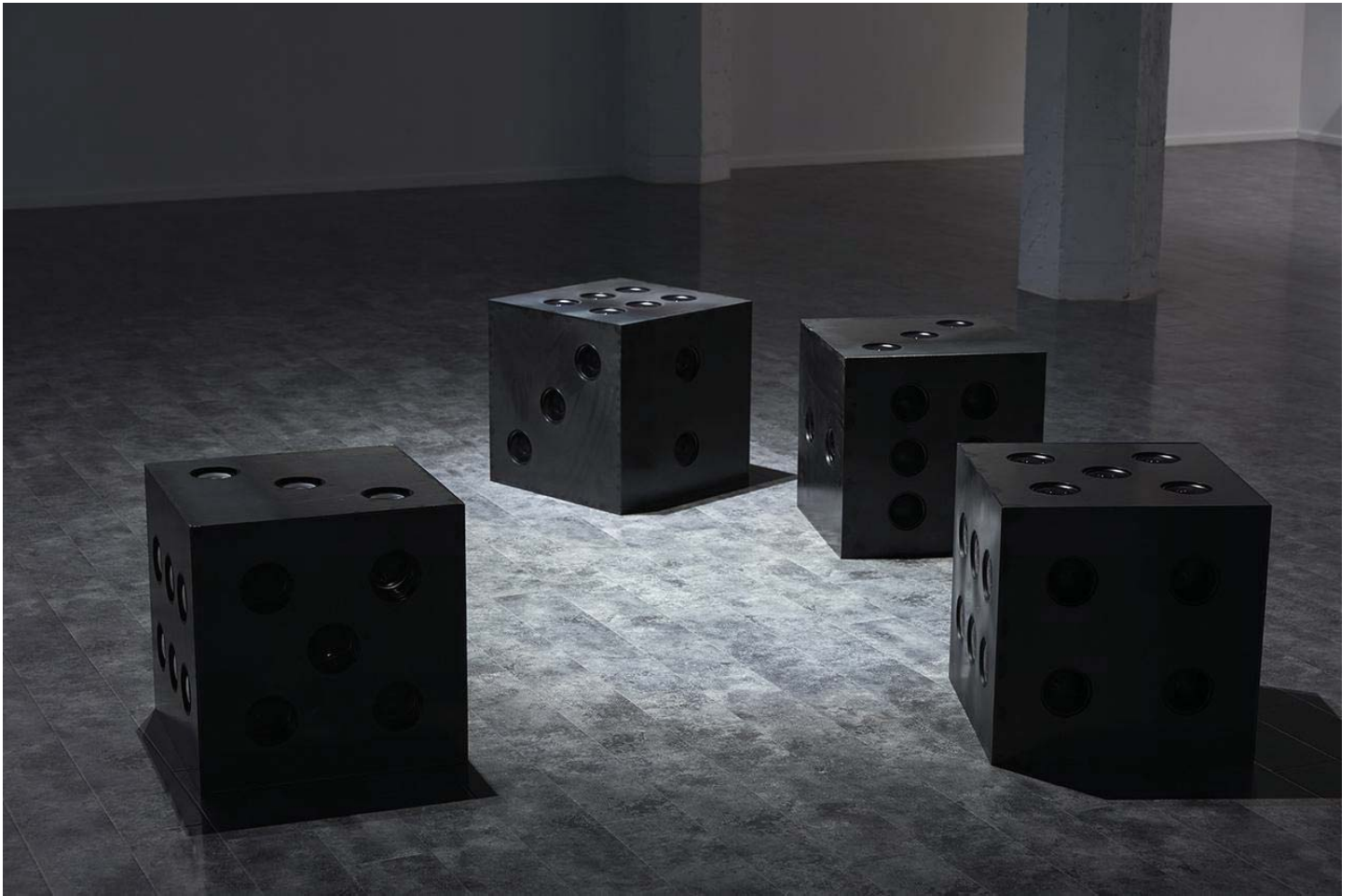
窥视 Scopophilia , 2016 激光切割铁板 , 相机镜头 | Laser cutting iron plate, camera lens 48 x 48 x 48 cm x 4 pieces