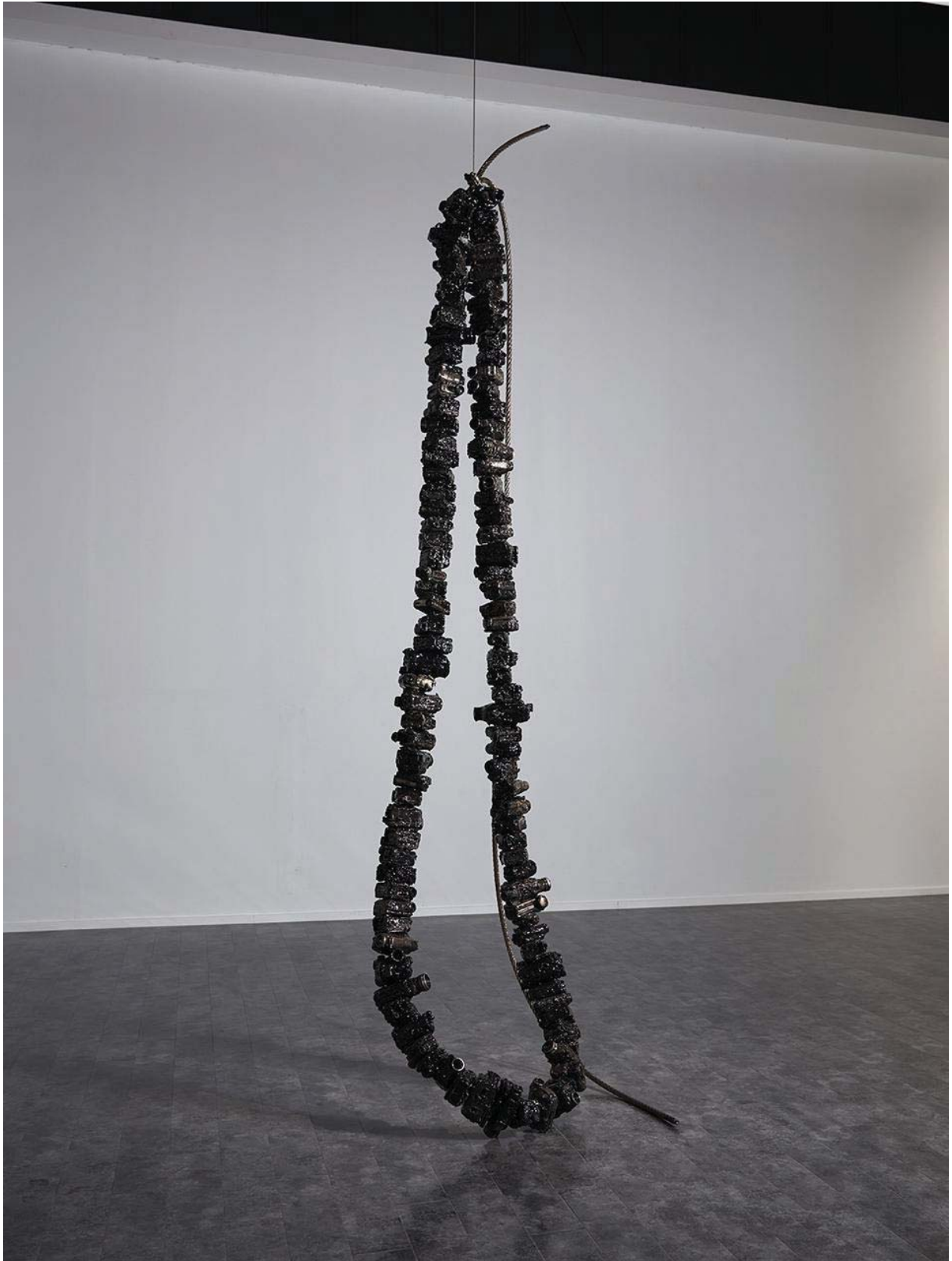
职业 Occupation , 2016 摄像机 , 钢索 , 油漆 | DV, cable wire, paints 360 x 100 x 80 cm