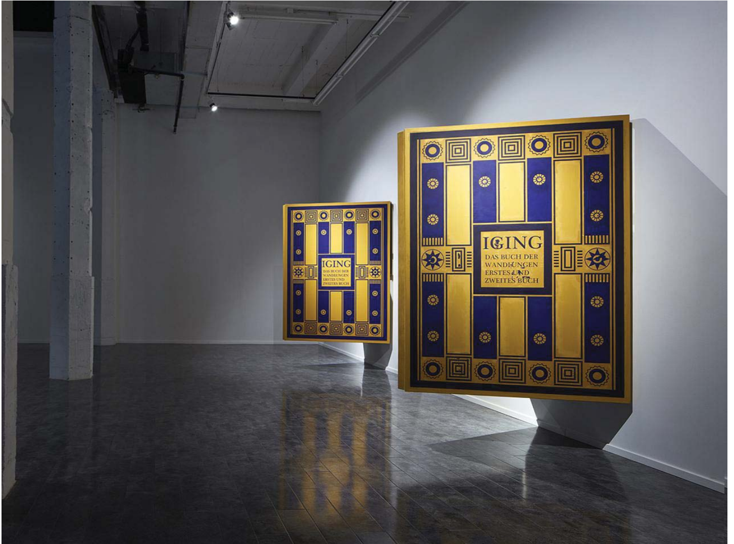
易经 I Ching , 2016 布面丙烯 | Acrylic on canvas 140 x 190 cm x 4 pieces 展示尺寸 : 115 x 135 x 190 cm