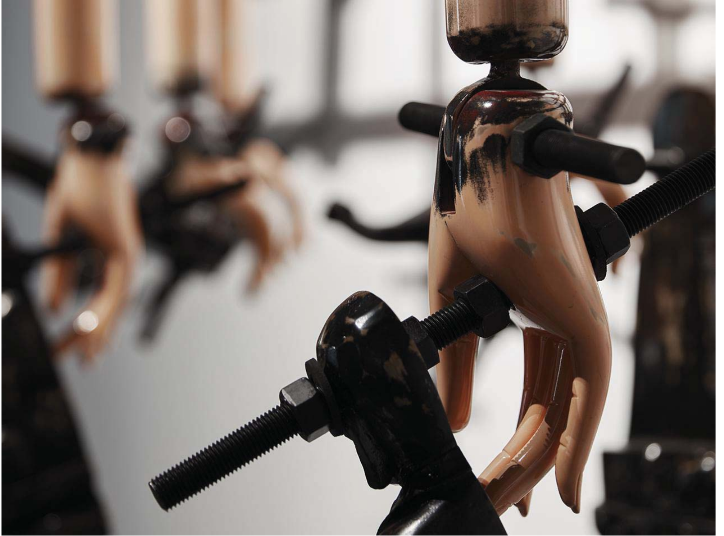
阳台 Balcony , 2016