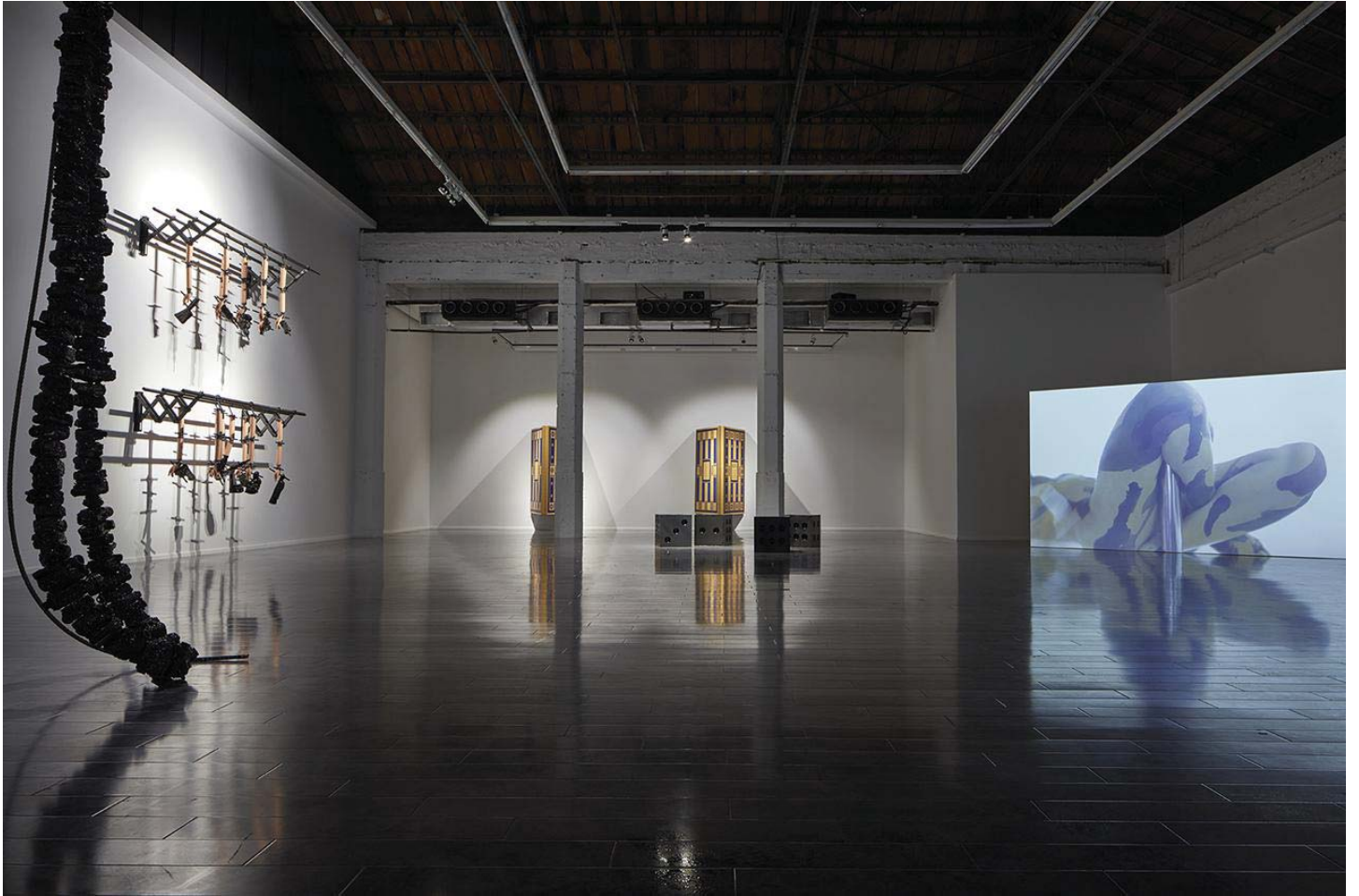
展览现场 Exhibition view