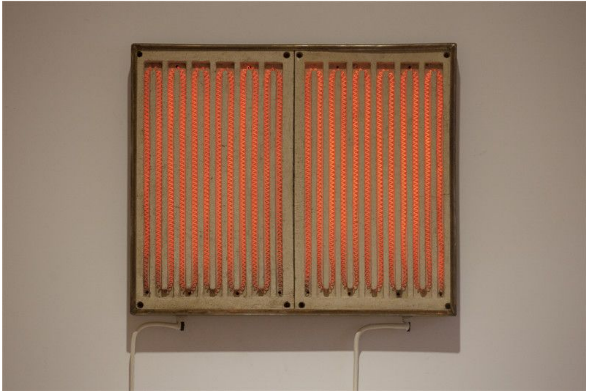
《呵呵》局部 Details of Hehe