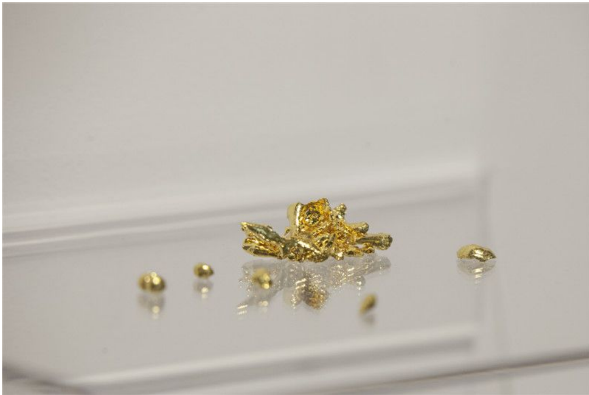
《一边堕落一边升华》局部 Details of Degenerating, sublimating