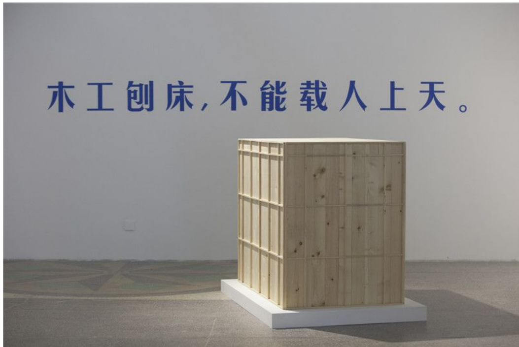
《木工刨床, 不能载人上天》局部, 木箱以及标语文字 Details: Wooden box and slogan