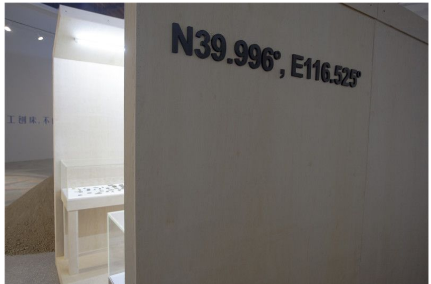
《如你所愿》局部 Details of As You Wish