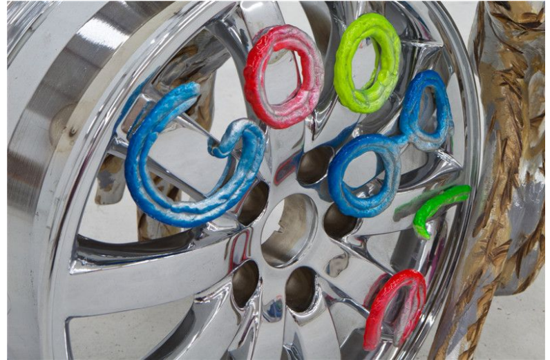
《日落》局部 Details of Sunset