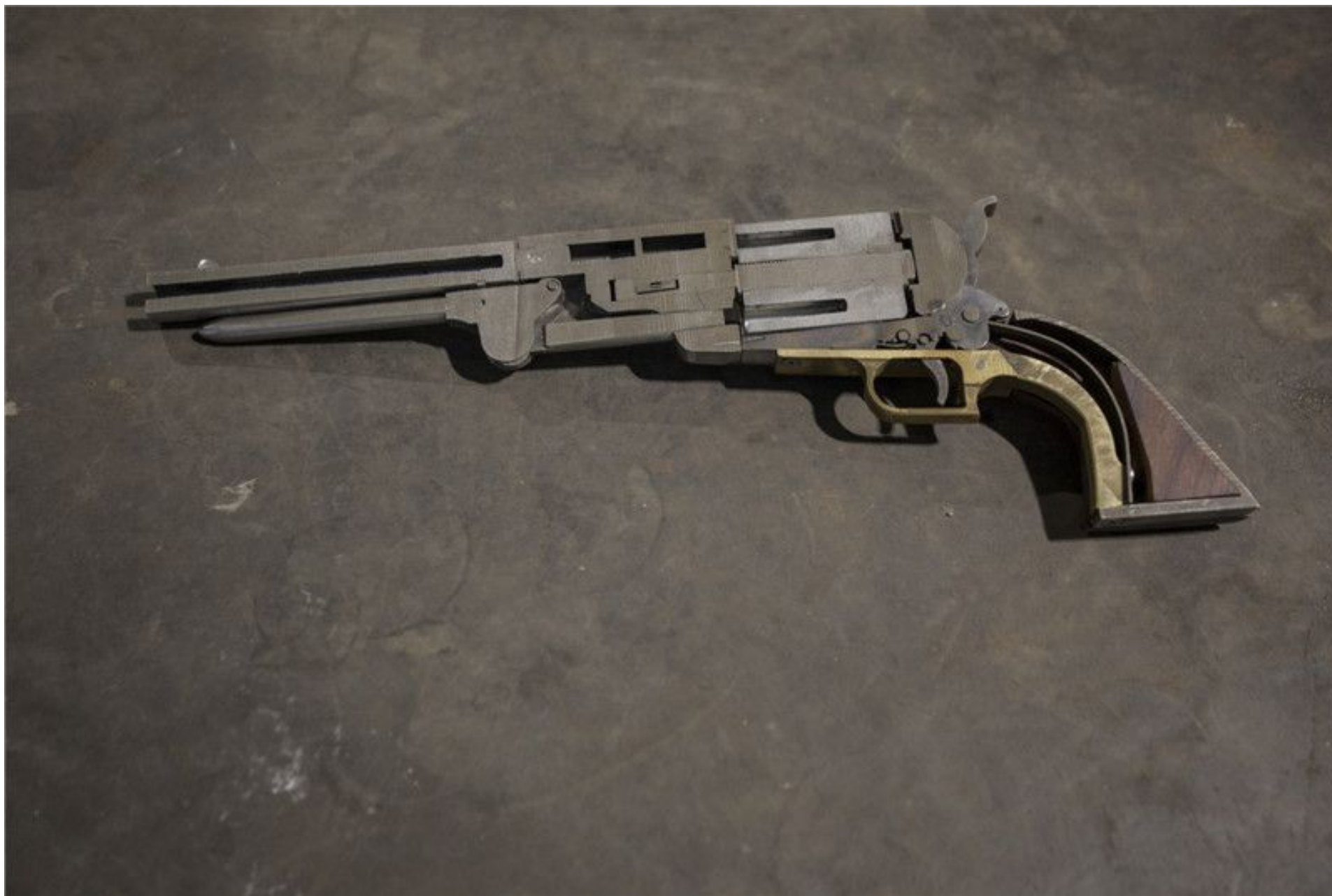
《20140719》局部 Details of 20140719