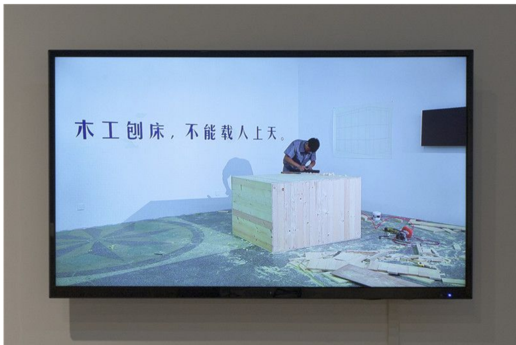
《木工刨床, 不能载人上天》局部, 录像 Details: Video