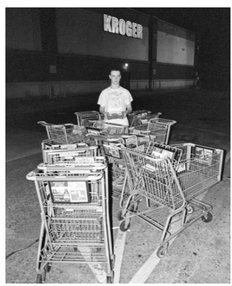
DeCarté May The line is here to protect the art, not to protect you (detail), 2018 Silver gelatin print 36 x 24 inches Image and work courtesy the artist