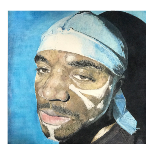
Joyane Eriom Dissolution (detail), 2018 Colored pencil on paper 30 x 24 inches Image and work courtesy the artist