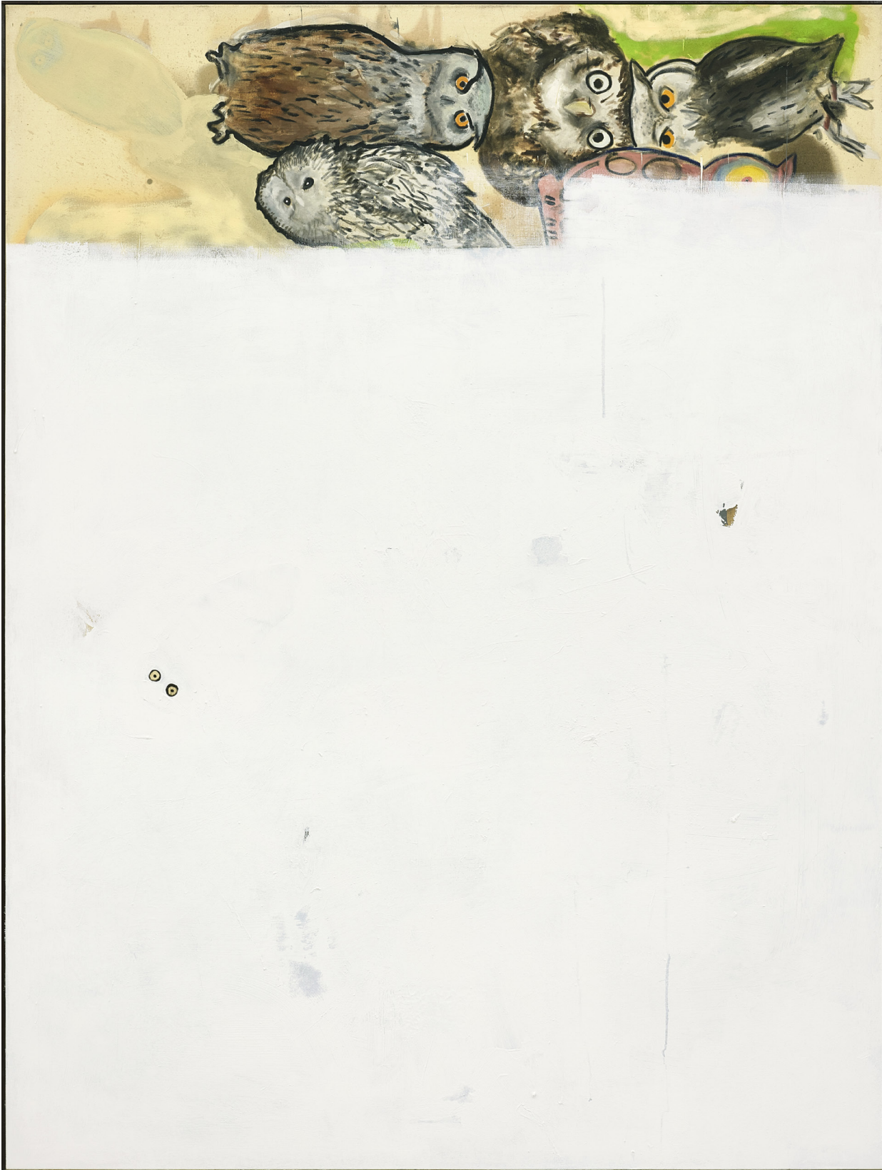
David Ostrowski Hatte bereits 5 Beziehungen (Political Paintings) , 2009/2019 Acrylic, lacquer, oil on canvas, wood 201 × 151 cm (framed)