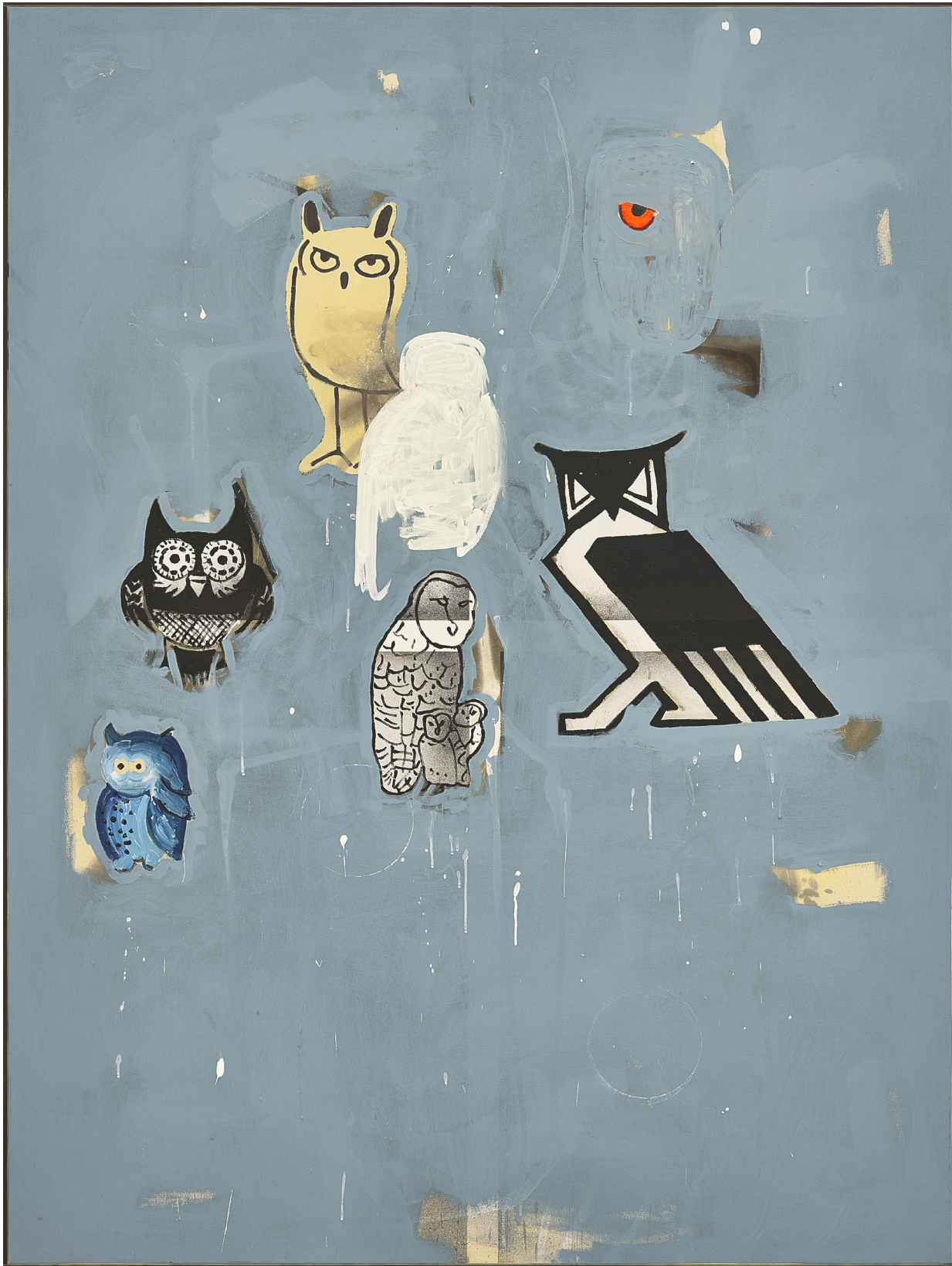
David Ostrowski Students of Albert Oehlen (Political Paintings) , 2009/2019 Acrylic, lacquer, oil on canvas, wood (framed) 201 × 151 cm