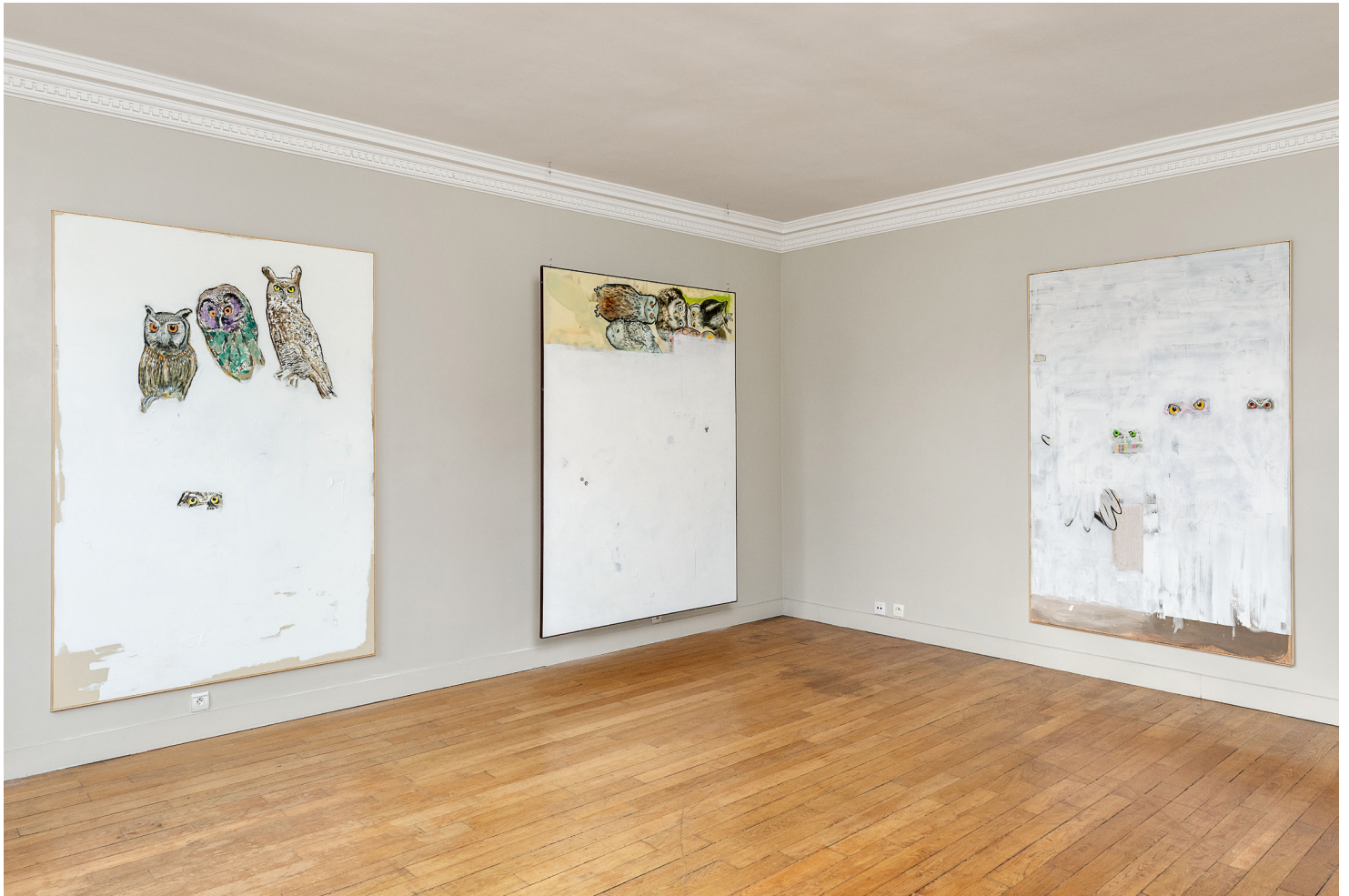
David Ostrowski Political Paintings Installation view, Sundogs, Paris, September 28 - November 3, 2019