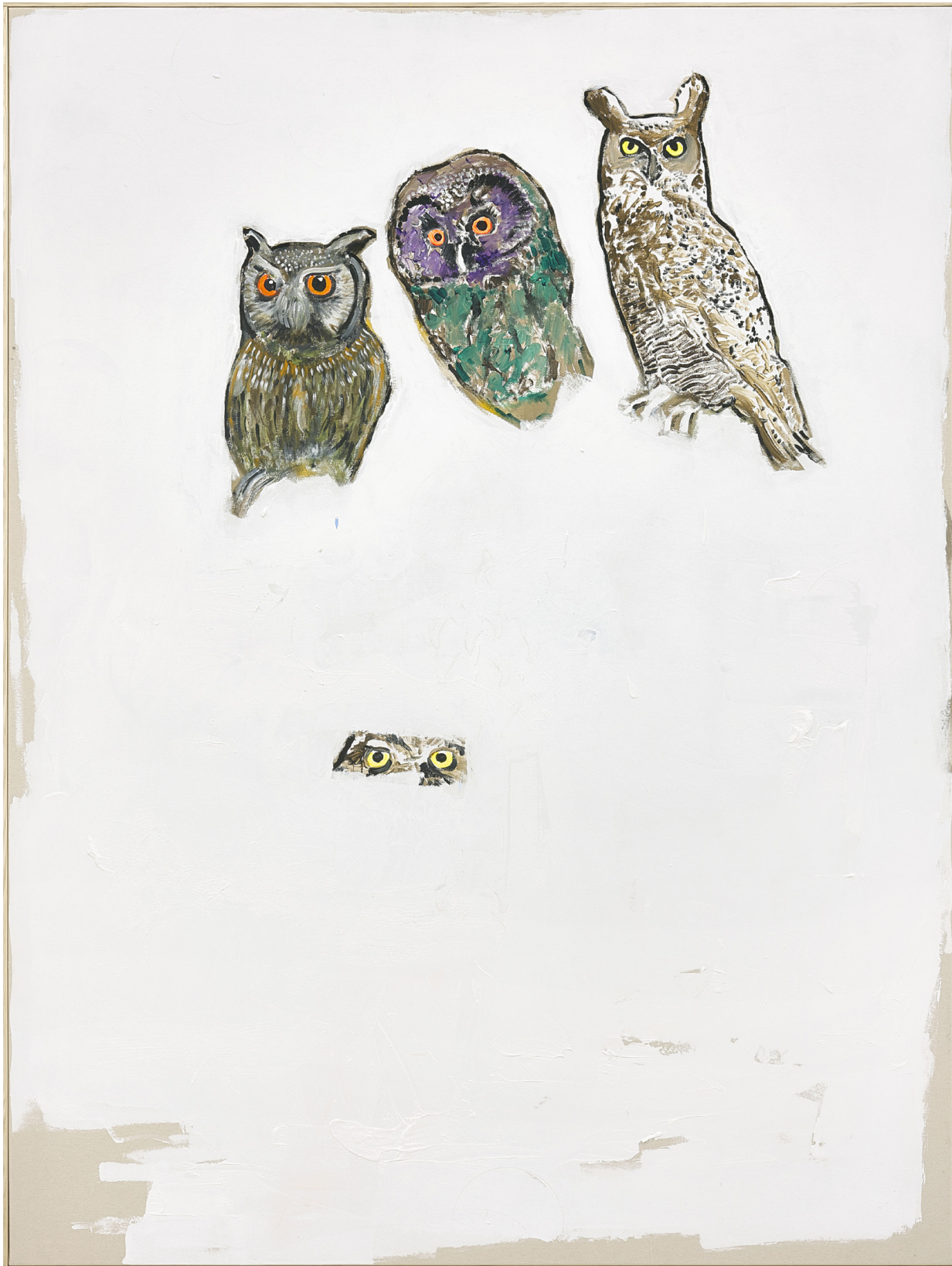
David Ostrowski Interessante Gespräche (Political Paintings) , 2019 Acrylic and lacquer on canvas, wood (framed) 201 × 151 cm