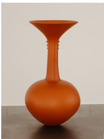
Magdalene Odundo Untitled, 2009 Hand-built, terra sigillata, polished and oxidized terracotta clay 49 x 25 cm (19 1/4 x 9 27/32 in)

Crafts Council Collection: P423.