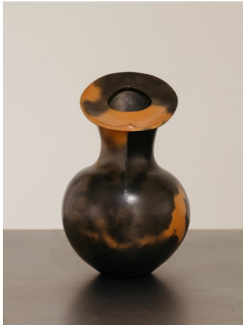
Magdalene Odundo Untitled, 1984 Burnished and carbonised terracotta 31.5 x 20 cm