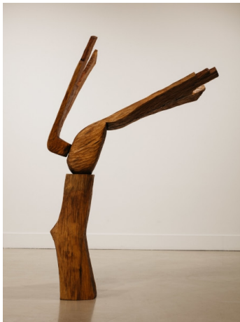
Thaddeus Mosley Repetitive Reference , 2015 Walnut 223.5 x 132.1 x 66 cm (88 x 52 x 26 in)

63.5 x 24.8 x 25.4 cm (25 x 9 3/4 x 10 in)