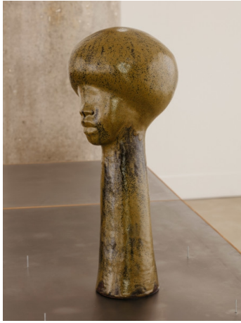
Simone Leigh Stretch (GREEN) , 2020 Stoneware and teadust glaze