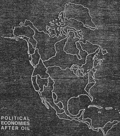
POLITICAL ECONOMIES AFTER OIL

The present political and economic division of space does not satisfy our needs. We work towards a reorganization of existing elements into more functional configurations