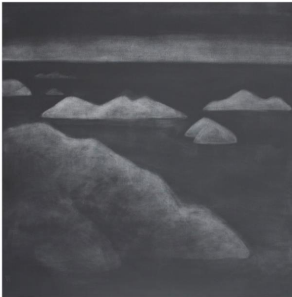
Silke Otto-Knapp "Islands (Black Sky)", 2014 Watercolour on canvas 100 x 100 cm

Tue-Sat 12:00-19:00 Closed on Sun, Mon and National holidays