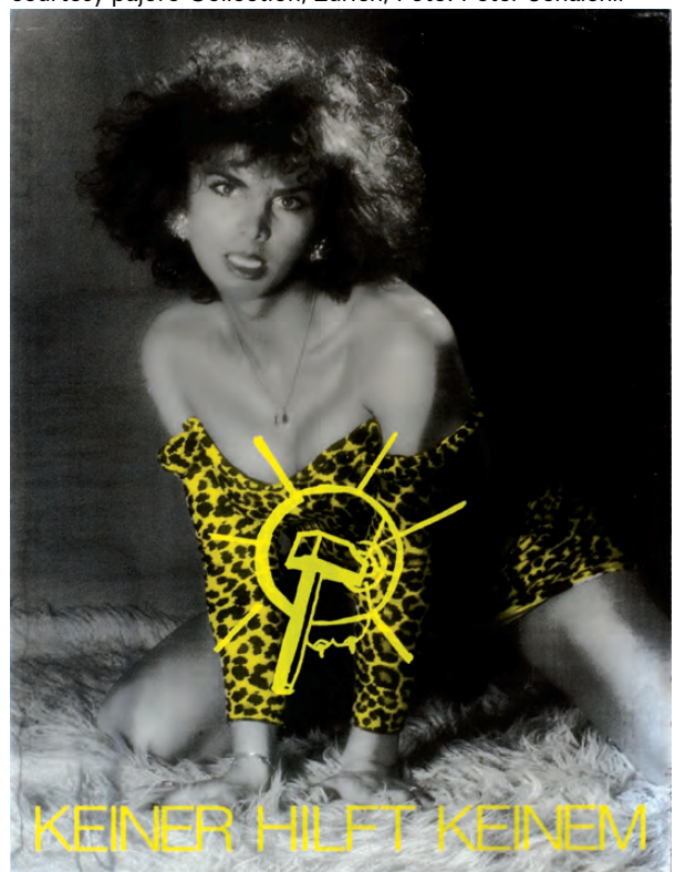
Jörg Schlick, Nora, I'm a shaver, I like your mooshy, I'm Schlick (politisch ziemlich korrekt), 1994, serigraph on polystyrene mirror mounted on wood, edition 9 (+ 3) ed. Artelier, Graz