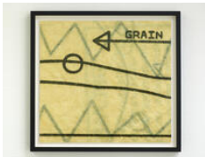
Erica Baum Grain , 2019 (Patterns) Archival pigment print 40,6 × 43,7 cm Edition 2/6 + II AP