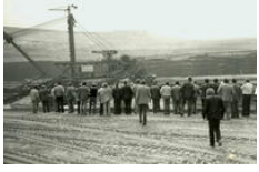
Geschichtswerkstatt Mönchengladbach Archival material from the Mönchengladbach city archive