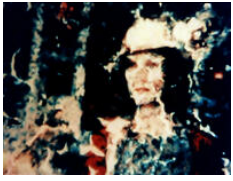
SCHMELZDAHIN Stadt in Flammen , 1979 Digitized Super-8, color, sound 00:06:00