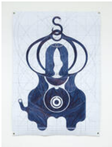
Jean Katambayi Mukendi Sturmlaterne , 2021 (Afolamps) Ballpoint pen and marker on paper 91 × 64 cm