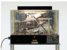
Irma Hünerfauth Blaue Pistole , 1973 Offset print, hand control, tape (loop), text by Meta Kristall, spoken word by Irma Hünerfauth Vitrine: 21 × 41 × 28 cm