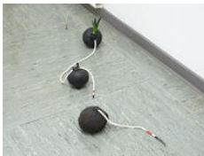
Phung-Tien Phan Untitled , 2018 / 2021 Fruits and vegetables, spray paint, silicone, cord, acrylic Dimensions variable