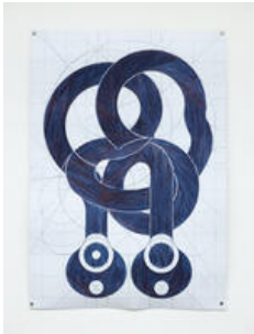
Jean Katambayi Mukendi Pipeline , 2021 (Afolamps) Ballpoint pen and marker on paper 91 × 64 cm