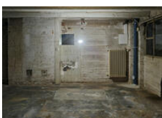
Kitty Kraus Untitled , 2011 Halogen lamp, antennas, cables Dimensions variable Edition 3/5