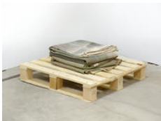
Rochelle Feinstein Plein Air 1 & 2 , 2018 Acrylic on cotton, grommets 250 × 329 cm