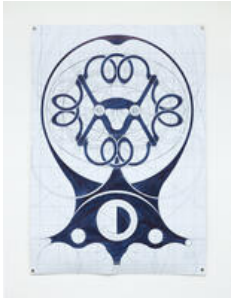
Jean Katambayi Mukendi Tungstène , 2021 (Afolamps) Ballpoint pen and marker on paper 91 × 64 cm