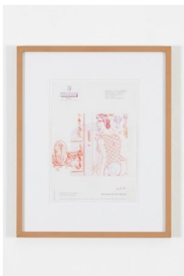
Ohne Titel (Hotel – Pension Schneider)