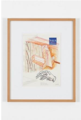
Ohne Titel (Nizza Hotel)