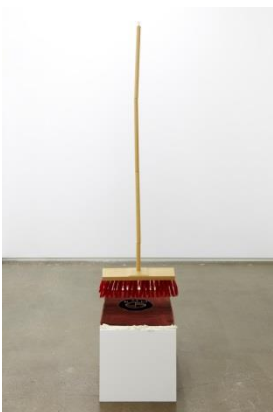
Tentative allemande de ne pas effacer la Memoire de Chet Baker German attempt to not clear the Memory of Chet Baker