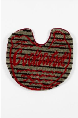
Goethestadt Goethe Town 1990 Wool 2 x 67 x 65 cm