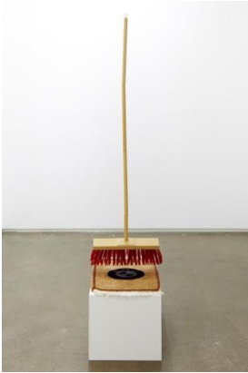
Tentative allemande de ne pas effacer la Memoire de Chet Baker German attempt to not clear the Memory of Chet Baker