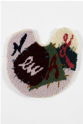
New Age 1990 Wool 2 x 53 x 53 cm