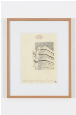
Ohne Titel (Hotel Metropole)