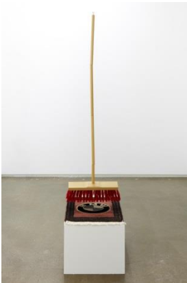
Tentative allemande de ne pas effacer la Memoire de Chet Baker German attempt to not clear the Memory of Chet Baker