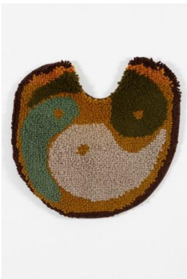
Ying und Yang Ying and Yang 1990 Wool 2 x 53 x 53 cm