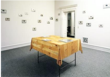
Ohne Title / Untitled (Tokyo Table)