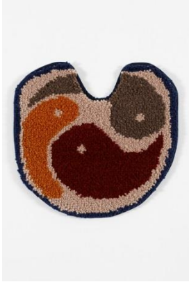
Ying und Yang Ying and Yang 1990 Wool 2 x 53 x 53 cm