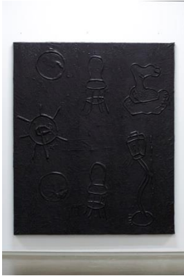
Ohne Titel (aus der Serie Schwarze Gummibilder)

Untitled (from the series Black Rubber Paintings)