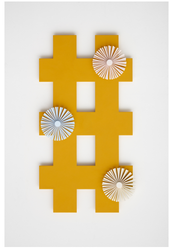
Lisa Williamson Primo 2021

Flashe and microbeads on primed aluminum 38 \times 20 \frac{1}{2} \times 2 \frac{1}{4} inches; 96.5 \times 52 \times 5.7 cm