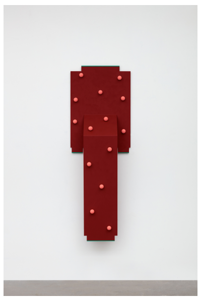
Lisa Williamson Silhouette (Orbs) 2021 Flashe on primed aluminum 64 x 22 x 9 3/4 inches; 162.5 x 56 x 25 cm Courtesy the artist and Tanya Bonakdar Gallery, New York / Los Angeles (file name: TBG 22707)