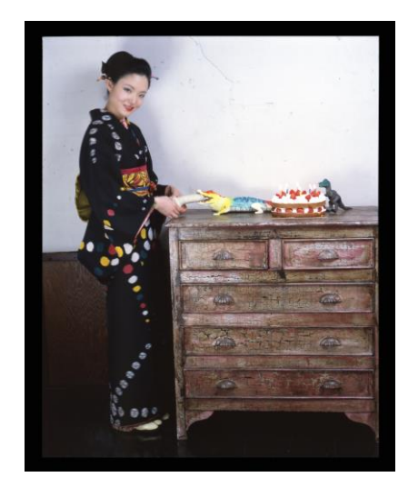
Nobuyoshi Araki " azalƏ gnixooJ ərlt riguorid irlə irlə irlə irlə irlə RP-Pro Crystal print Image size: 40.5 x 32.4 cm Paper size: 43.2 x 35.6 cm © Nobuyoshi Araki

Paper size: 35.6 x 43.2 cm © Nobuyoshi Araki