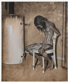
Kye Christensen-Knowles Home Video III , 2021 Oil on Canvas 72 x 60 inches (182.88 x 152.40 cm)