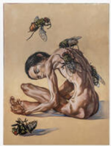
Kye Christensen-Knowles The Drop Out , 2021 acrylic and oil on canvas 48 x 36 inches (121.92 x 91.44 cm)