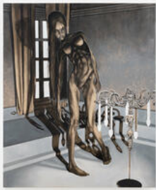
Kye Christensen-Knowles Home Video II , 2021 Oil on Canvas 72 x 60 inches (182.88 x 152.40 cm)