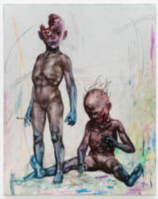
Kye Christensen-Knowles The Children , 2021 marker and oil on canvas 60 x 48 inches (152.40 x 121.92 cm)