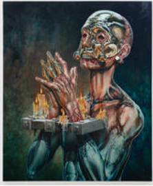
Kye Christensen-Knowles Behind the Curtain of Silence , 2021 oil on canvas 72 x 60 inches (182.88 x 152.40 cm)

LOMEX ALEXANDER SHULAN FINE ART 86 WALKER # 3, 10013 917.667.8541 INFO@LOMEX.GALLERY