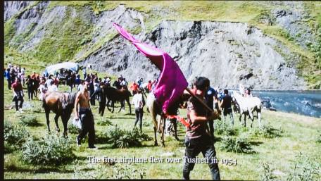
Sophio Medoidze Xitana HD video, 5:52 min, installation, 2019 (frame detail)