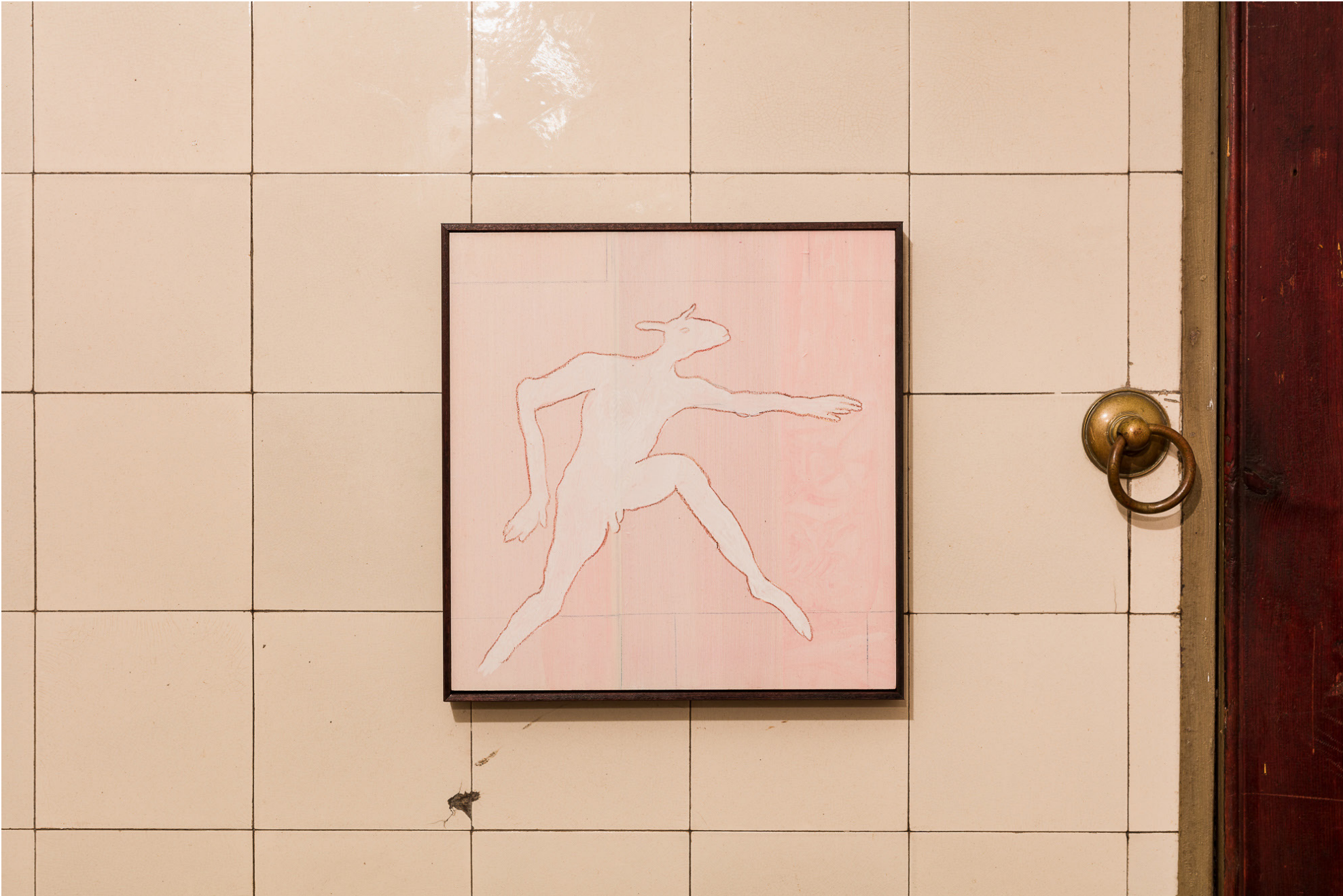
Nicola Pecoraro, Untitled , 2020 Acrylic, colored pencil, marker on wood, 32,5 x 31,5 cm