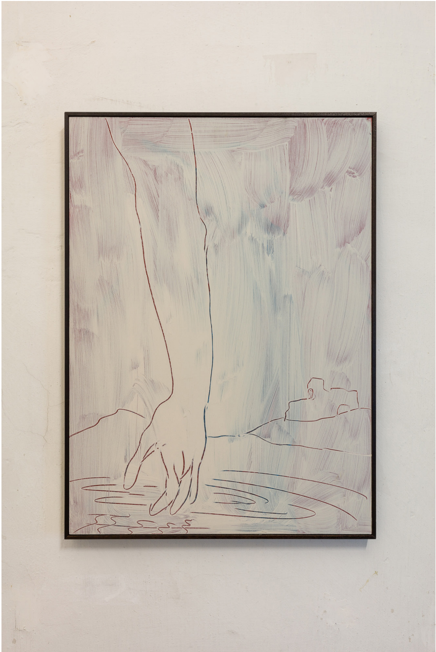
Nicola Pecoraro Untitled , 2020 Acrylic on wood 56 x 41 cm