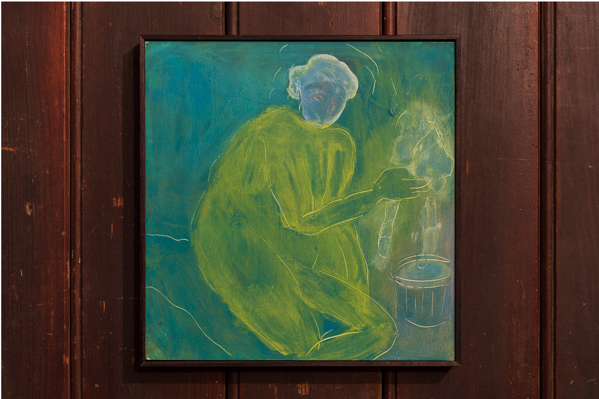
Nicola Pecoraro, Untitled , 2020, Acrylic on wood, 31,5 x 32,5 cm