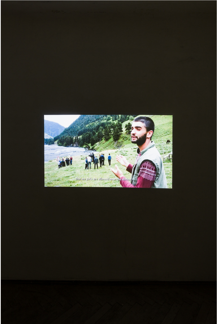
Sophio Medoidze Xitana HD video, 5:52 min, installation, 2019 (frame detail)