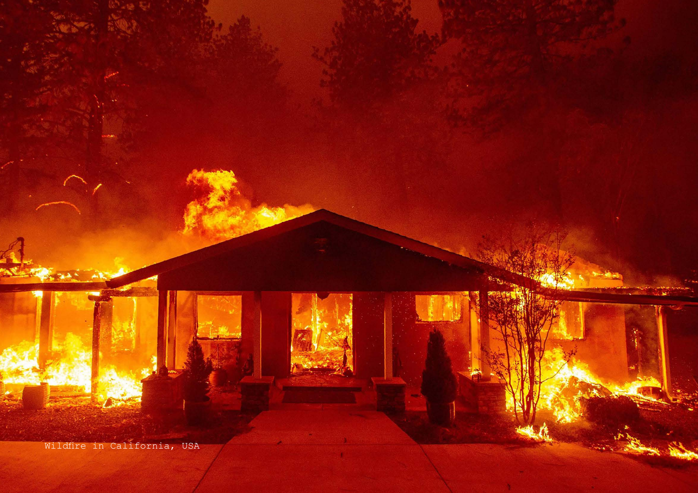
Wildfire in California, USA