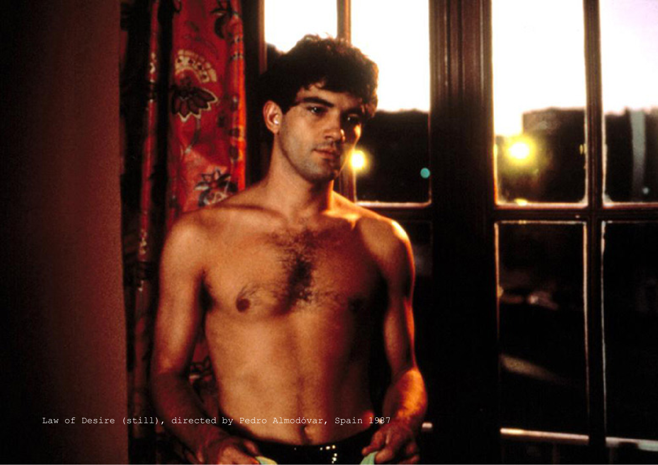
Law of Desire (still), directed by Pedro Almodóvar, Spain 1987