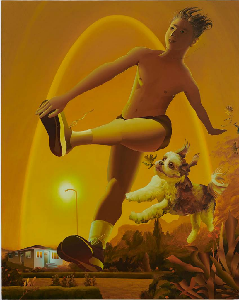
The Fool, 2021

Acrylic on wooden panel 152.4 x 121.9 x 6.3 cm 60 x 48 x 2 1/2 in