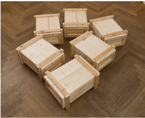
NSG Lot. 01 (No Stolen Goods), 2021 Printed photographs on baryta paper, wax sealed wooden box. Vary variable dimensions