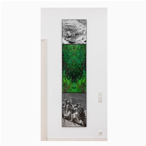
SDC 002 (Deontological Cloth), 2021 Print on baryta cotton fine art paper rag 220 x 50 x 3 cm