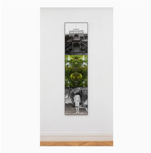
SDC 001 (Deontological Cloth), 2021 Print on baryta cotton fine art paper rag 200 x 50 cm x 3 cm