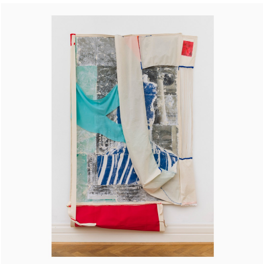
Axiluanda II (M006), 2021 Mixed textile, transfer, collage, stitches, hand sewing, acrylic paint and rope. 190 x 130 cm