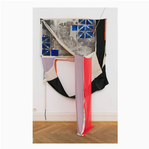
Axiluanda I (M005), 2021 Mixed textile, transfer, collage, stitches, hand sewing, acrylic paint and rope. 200 x 140 x 70 cm