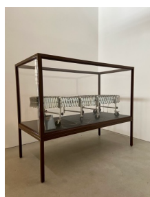
THEASTER GATES (b. 1973) History of Conveyance , 2021 Accordion conveyor, book and vitrine 80 3/4 × 100 × 48 inches 205.1 × 254 × 121.9 cm