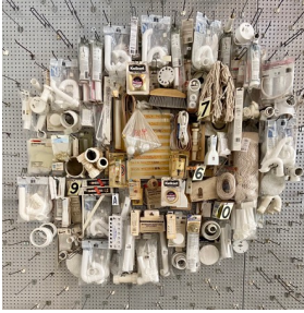
THEASTER GATES (b. 1973) Circle , 2021 Steel pegboard, pegs and hardware store inventory 72 × 72 × 15 inches 182.9 × 182.9 × 38.1 cm