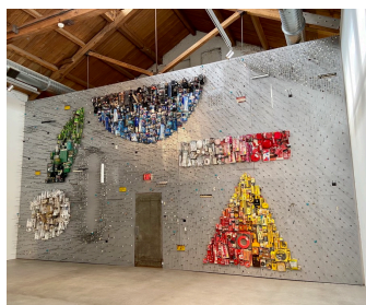
THEASTER GATES (b. 1973) Hardware Store Painting , 2021 Steel pegboard, pegs and hardware store inventory 230 5/8 × 425 1/2 × 15 inches 585.8 × 1080.8 × 38.1 cm