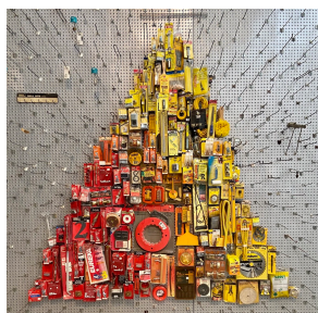
THEASTER GATES (b. 1973) Triangle , 2021 Steel pegboard, pegs and hardware store inventory 96 × 96 × 15 inches 243.8 × 243.8 × 38.1 cm

1018 Madison Ave, 2nd Fl New York, NY 10075 +1 212 472 8787