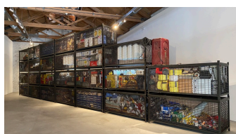
THEASTER GATES (b. 1973) Retaining Wall , 2021 Twenty-five custom steel gabions and hardware store inventory Approximate overall install: 178 × 39 ¼ × 696 inches (452 × 99.7 × 1767.8 cm)