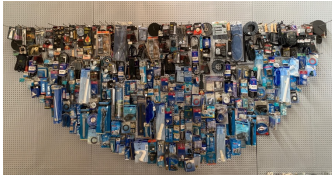
THEASTER GATES (b. 1973) Bowl , 2021 Steel pegboard, pegs and hardware store inventory 72 × 156 × 15 inches 182.9 × 396.2 × 38.1 cm