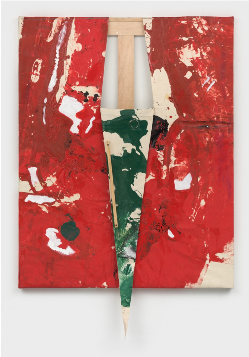
ROSY KEYSER Earliest Camouflage , 2021 acrylic enamel, oil, wood, and steel on canvas 69 x 46 inches