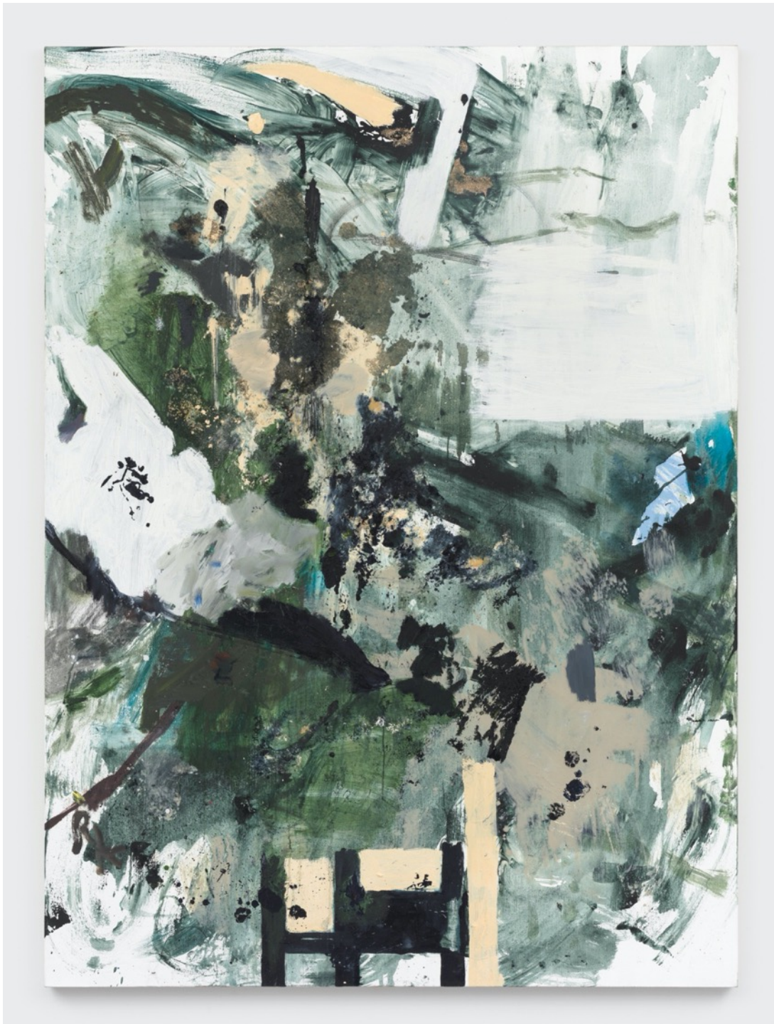
ROSY KEYSER Sash Pane Dispersion , 2020 oil, distemper, & sawdust on canvas 76 x 56 inches