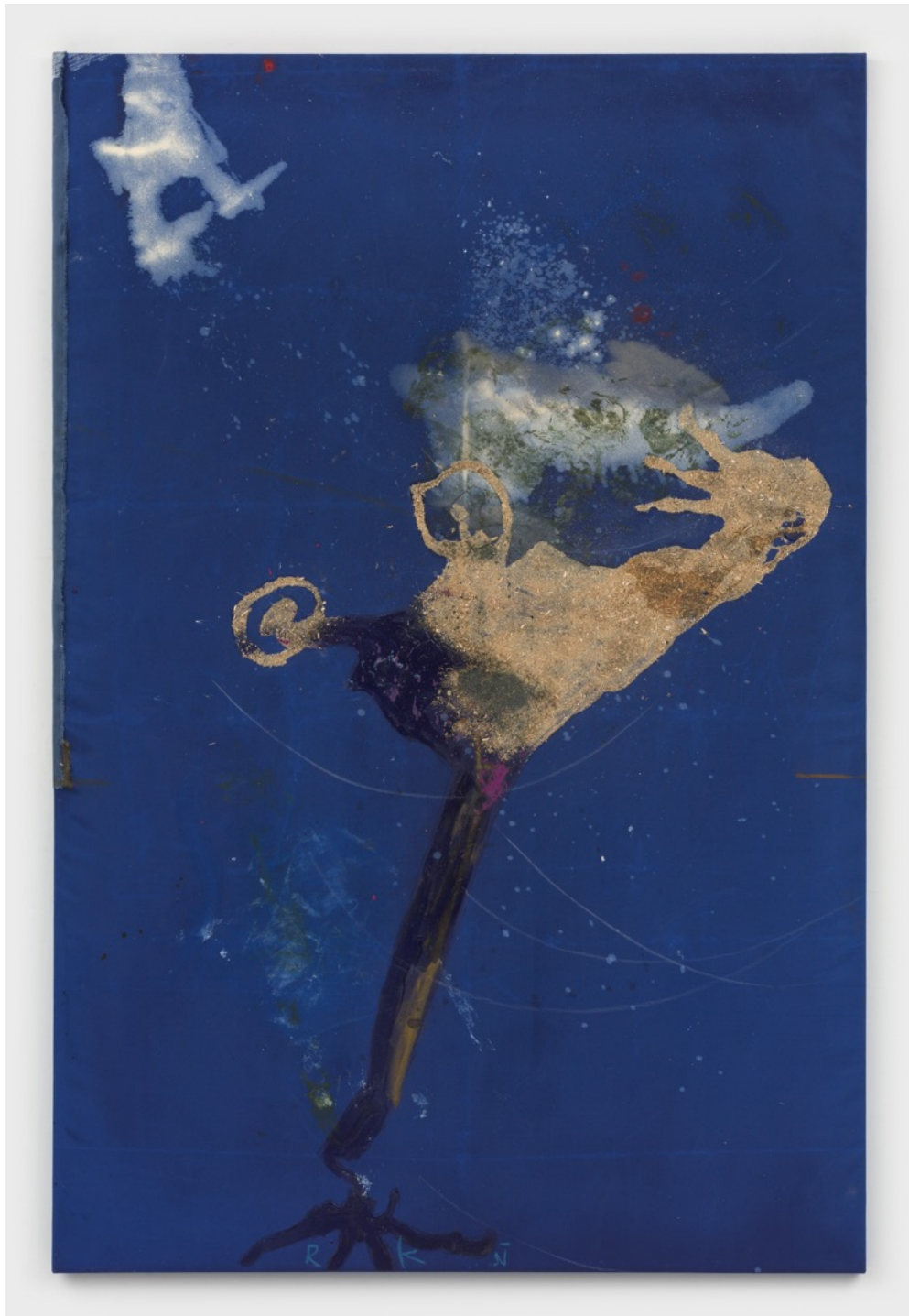
ROSY KEYSER Roughshodder , 2021 oil, medium, pastel, and sawdust on waxed canvas 78 x 52 inches