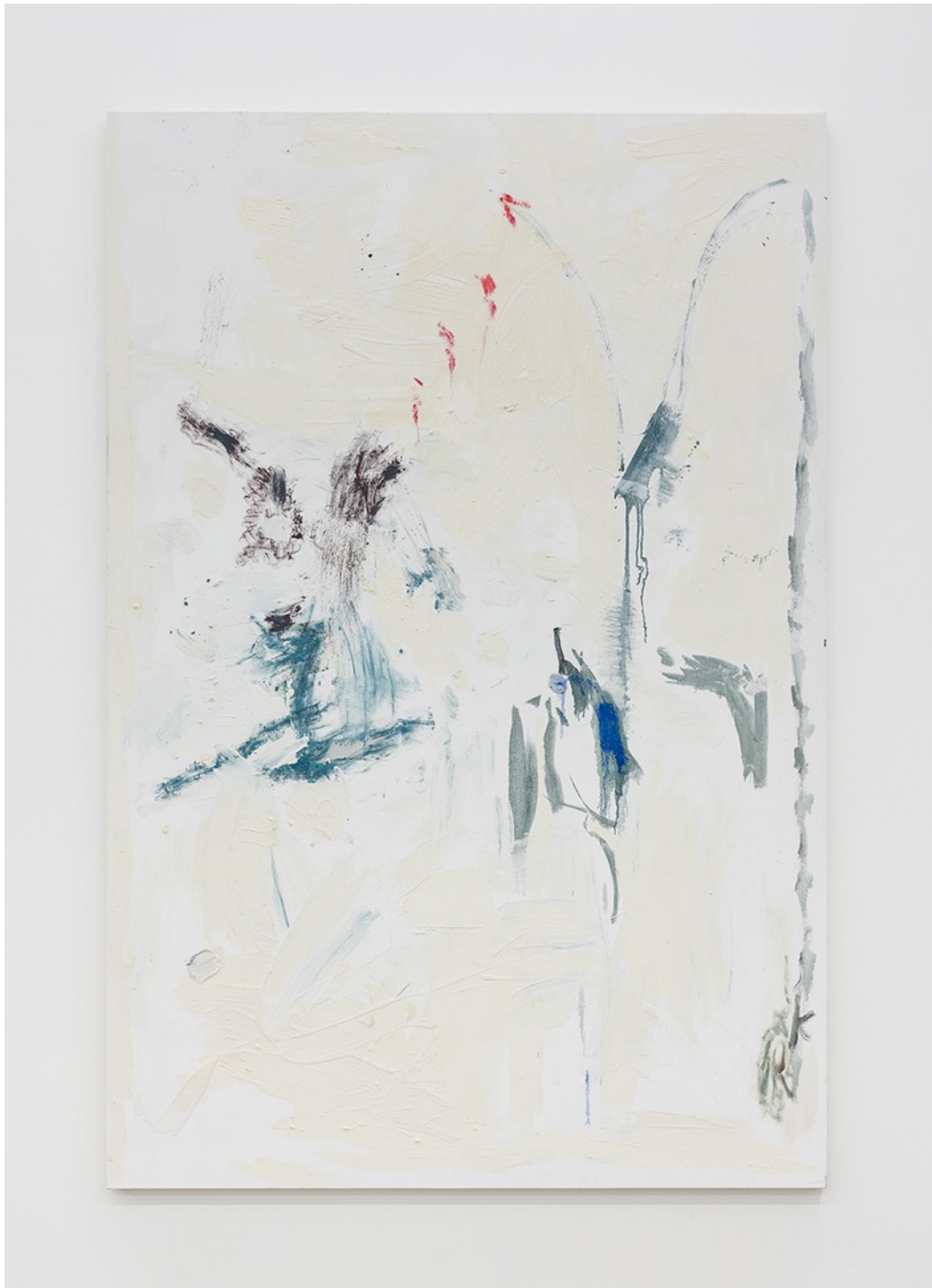
ROSY KEYSER Tuner Fader , 2020 pastel, medium, and oil on canvas 90 x 60 inches