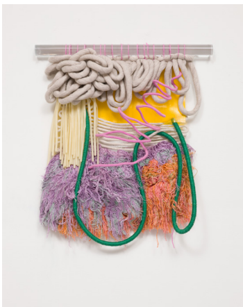
Unravel Handwoven tapestry - Silk thread, felted wool, wire, cotton thread, rope, rubber, monofilament, acrylic bar 29h x 22w inches 2018 USD 4 000