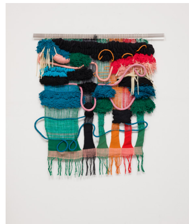
Transmutation Handwoven tapestry - Cotton thread, rope, roving wool, wire, tubing, neoprene, nylon, polyfil, rubber, wire, acrylic bar 45h x 35w inches 2018 USD 5 000