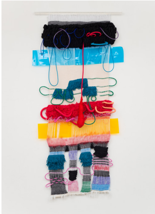
Flow Handwoven tapestry - Roving wool, PVC, tubing, wire, neoprene, rope, cotton thread, plastic, nylon, polyfil, cyberlox, spray paint, acrylic bar 88h x 48w inches 2018 USD 8 000