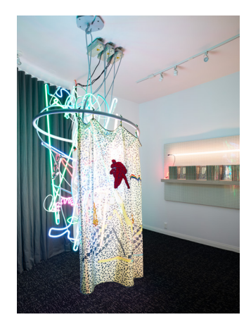
A Warm Screen 2019 Dimensions variable Powder-coated aluminum, polyester, neon, transformers USD 12,000