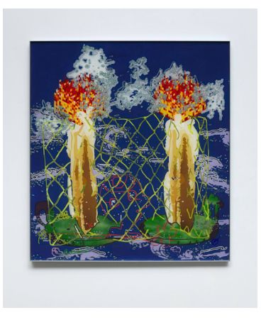
Untitled 2019 44h x 40w x 1.5d in. framed Acrylic, urethane on etched acrylic panel USD 8,600