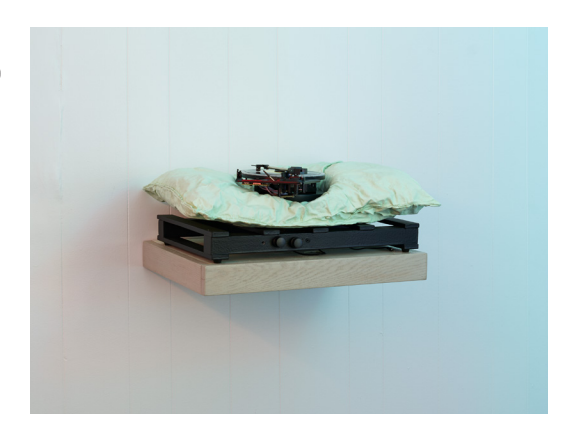
Think a little sugar 2018 26l x 18w x 10d in. Urethane, wood, and electronics USD 4,000