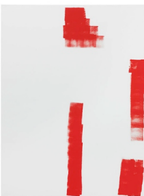
MK/M 2014/07, 2014 acrylic on canvas 160 x 120 cm MK/M 2014/07