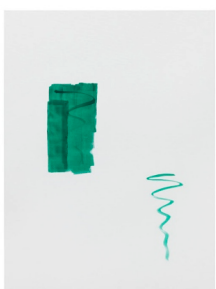
MK/M 2014/10, 2014 acrylic on canvas 160 x 120 cm MK/M 2014/10