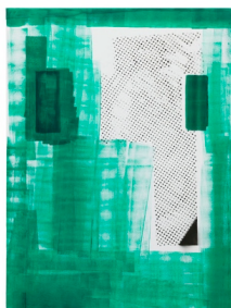
MK/M 2014/15, 2014 acrylic and spray paint on canvas 160 x 120 cm MK/M 2014/15