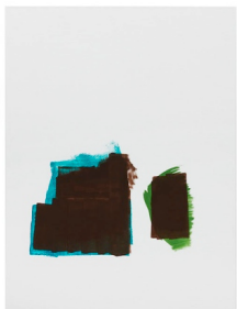
MK/M 2014/04, 2014 acrylic on canvas 160 x 120 cm MK/M 2014/04