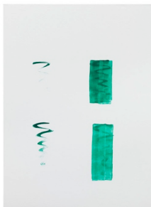
MK/M 2014/19, 2014 acrylic on canvas 160 x 120 cm MK/M 2014/19