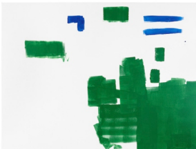
MK/M 2014/01, 2014 acrylic on canvas 120 x 160 cm MK/M 2014/01