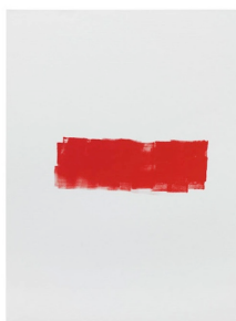
MK/M 2014/16, 2014 acrylic on canvas 160 x 120 cm MK/M 2014/16