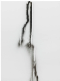
MK/M 2014/21, 2014 spray paint on canvas 160 x 120 cm MK/M 2014/21