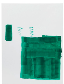
MK/M 2014/12, 2014 acrylic on canvas 160 x 120 cm MK/M 2014/12