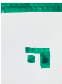
MK/M 2014/05, 2014 acrylic on canvas 160 x 120 cm MK/M 2014/05