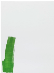
MK/M 2014/20, 2014 acrylic on canvas 160 x 120 cm MK/M 2014/20