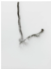
MK/M 2014/06, 2014 spray paint on canvas 160 x 120 cm MK/M 2014/06