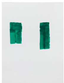
MK/M 2014/17, 2014 acrylic on canvas 160 x 120 cm MK/M 2014/17