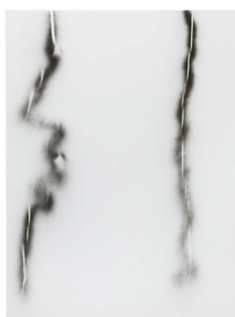
MK/M 2014/09, 2014 spray paint on canvas 160 x 120 cm MK/M 2014/09