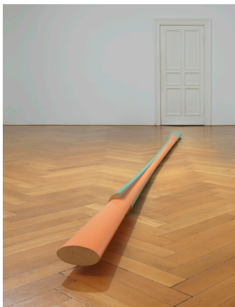
Isa Genzken “Grün-orange-graues Hyperbolo 'El Salvador'”, 1980 wood, lacquer 15 x 19 x 600 cm IG/S 1980/01