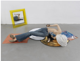
Isa Genzken "Schauspieler", 2013 mannequin, fabric, shoes, plastic, lacquer, mirror, color print on paper installation dimensions variable IG/S 2013/09