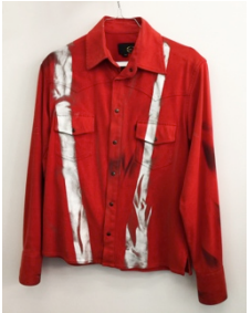
Isa Genzken "Hemd", 1998 fabric, buttons, paint Shirt, Size 46 68 x 50 cm IG1998_54