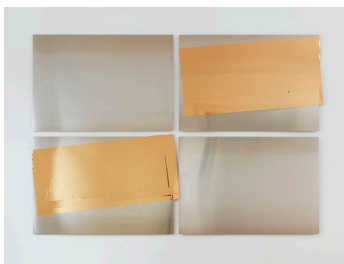
Isa Genzken “Gold und Silber”, 2015 4 parts, steel panels, mirror foil overall dimensions: 185.5 x 269 x 2 cm IG/W 2015/38