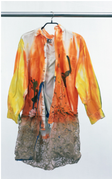
Isa Genzken "Hemd", 1998 fabric, buttons, cloth flowers, paint, metal, chain Shirt, Size M 100 x 65 cm IG1998_23