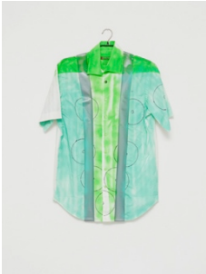
Isa Genzken "Hemd", 1998 fabric, buttons, paint, felt pen, adhesive tape Shirt, Size unknown 87 x 57 cm IG1998_52