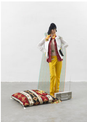
Isa Genzken "Schauspieler", 2013 mannequin, pillow, fabric, leather, plastic foil, plastic, metal, glass, concrete, antennae 184 x 138 x 165 cm IG/S 2013/13