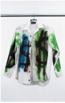
Isa Genzken "Hemd", 1998 plastic, buttons, paint Shirt, Size XL 90 x 55 cm IG1998_13