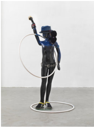
Isa Genzken "Schauspieler", 2013 mannequin, toy animal, two hula hoop rings, hat, 2 bracelets, watch, belt, shoes, lacquer, plastic, leather, glass 165 x 80 x 80 cm IG/S 2013/07