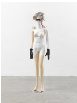
Isa Genzken "Schauspieler", 2013 mannequin, wig, glasses, lacquer, felt pen, leather gloves, ceramic figurines, metal, plastic, glass 184 x 47 x 27 cm IG/S 2013/06