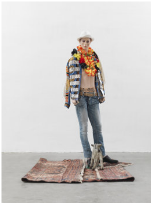
Isa Genzken "Schauspieler", 2013 mannequin, carpet, plastic goat, wig, fabric, leather, adhesive tape, plastic 189 x 141 x 151 cm IG/S 2013/14