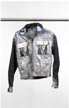
Isa Genzken "Hemd", 1998 fabric, zipper, buttons, paint, postcards Jeans Jacket, Size S 64 x 57 cm IG1998_32