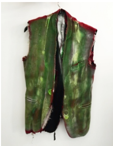
Isa Genzken "Jacke", 1998 fabric, paint jacket, sleeves detached, size XXL 88 x 50 cm IG1998_21