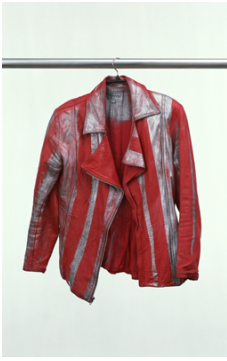
Isa Genzken "Jacke", 1998 leather, zipper, fabric, paint leather jacket, Size S 73 x 48 cm IG1998_24