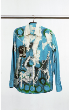
Isa Genzken "Hemd", 1998 fabric, buttons, paint, postcard Shirt, Size L 84 x 53 cm IG1998_17