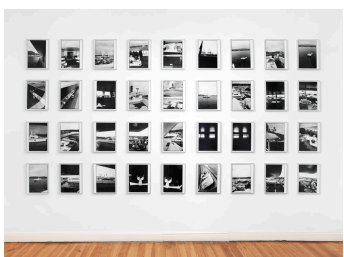
Isa Genzken “Yachturlaub”, 1993 36 b/w-photographs unique each print: 35 x 25 cm each framed: 42 x 32 x 2.5 cm IG/F 1993/07