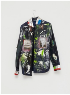
Isa Genzken "Hemd", 1998 fabric, buttons, plastic, photographs, printed paper, paint, adhesive tape Shirt, Size unknown 80 x 53 cm IG1998_47