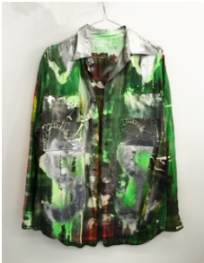
Isa Genzken "Hemd", 1998 fabric, buttons, paint, postcards Shirt, Size L 83 x 50 cm IG1998_12