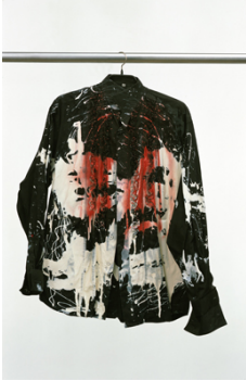
Isa Genzken "Hemd", 1998 fabric, buttons, paint Shirt, Size L 84 x 52 cm IG1998_30