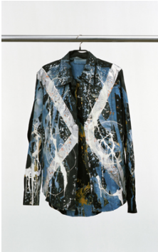
Isa Genzken "Hemd", 1998 fabric, buttons, paint, adhesive tape Shirt, Size M 86 x 53 cm IG1998_20