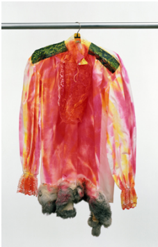
Isa Genzken "Hemd", 1998 fabric, cord, lace, oil on canvas, fur, paint Shirt, Size L 110 x 64 cm IG1998_31