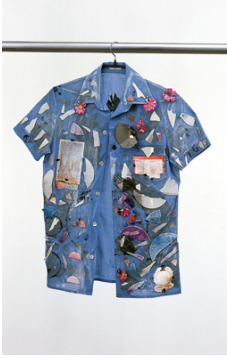
Isa Genzken "Hemd", 1998 fabric, buttons, paint, plastic, cloth flowers, paper, coin Shirt, Size S 77 x 54 cm IG1998_26