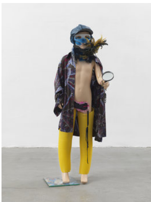
Isa Genzken "Schauspieler", 2013 mannequin, fabric, plastic, feathers, bracelets, magnifier, spray paint, adhesive tape, glass, metal, color print on paper 143 x 50 x 70 cm IG/S 2013/04