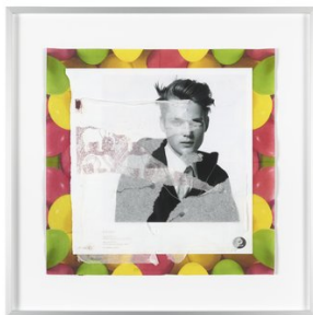
Isa Genzken "Untitled", 2014 collaged magazine page on paper, glue, tissue 32 x 32,5 cm IG/C 2014/10