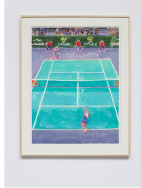
Brian Lotti Court 2 , 2019 Oil paint on Stonehenge paper 30h x 22w in 76.20h x 55.88w cm Unique BrL19.08.02