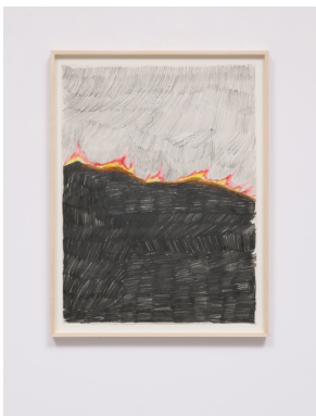
Matthew Chambers The outward signs , 2019 Pencil and colored pencil on paper 24h x 18w in 60.96h x 45.72w cm Unique MCha19.04a.14