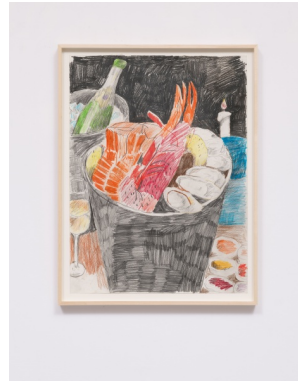
Matthew Chambers To put up with what is offered , 2019 Pencil and colored pencil on paper 24h x 18w in 60.96h x 45.72w cm Unique MCha19.04a.04