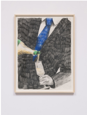
Matthew Chambers Something to steady the hand , 2019 Pencil and colored pencil on paper 24h x 18w in 60.96h x 45.72w cm Unique MCha19.04a.03