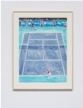
Brian Lotti Court 4 , 2019 Oil paint on Stonehenge paper 30h x 22w in 76.20h x 55.88w cm Unique BrL19.08.04