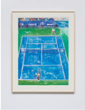
Brian Lotti Court 1 , 2019 Oil paint on Stonehenge paper 30h x 22w in 76.20h x 55.88w cm Unique BrL19.08.01