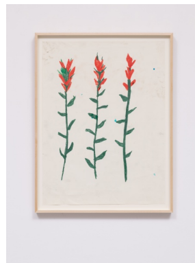
Matthew Chambers The lucky actors onscreen , 2019 Pencil and colored pencil on paper 24h x 18w in 60.96h x 45.72w cm Unique MCha19.04a.15