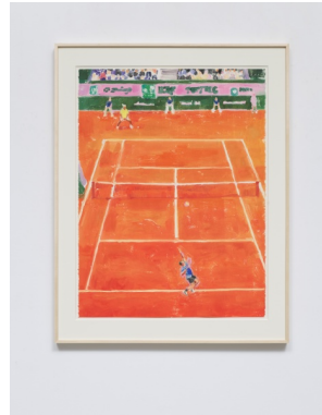
Brian Lotti Court 5 , 2019 Oil paint on Stonehenge paper 30h x 22w in 76.20h x 55.88w cm Unique BrL19.08.05